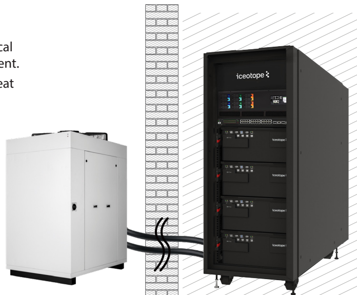
OUTDOOR COOLER *NOT TO SCALE