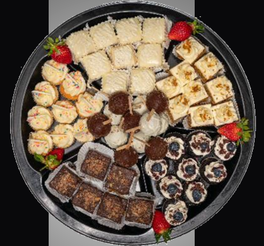
Sweet Platter 3