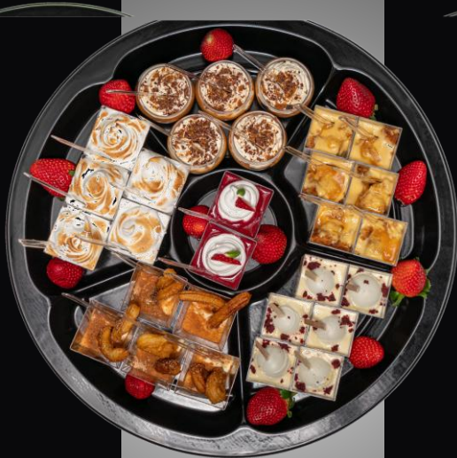
Sweet Canape Shots