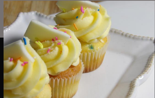
Mini Cup Cakes