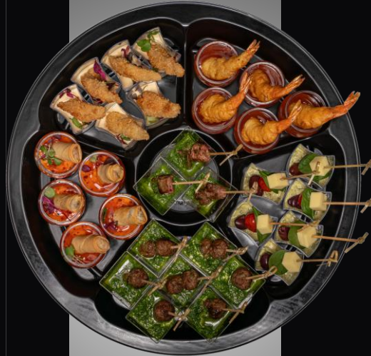
Canape Shot Glasses