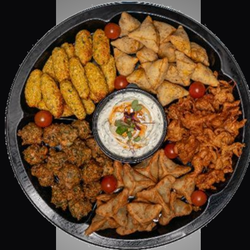
Taste of India