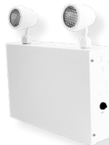
SD- 10032 SD- 10035