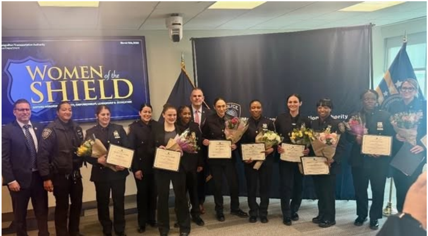
PBA Board Members attended the inaugural MTA Women of the Shield Ceremony at 2 Broadway to celebrate the remarkable achievements and contributions of our female members.