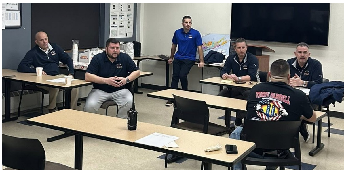
Members of the Executive Board met with PBA Members in District 1 for open discussion, answering questions and hearing concerns directly from the membership.