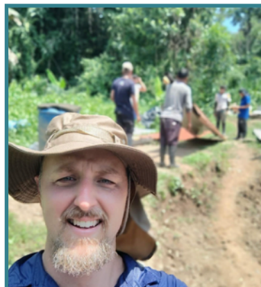
Working with the people in Tzapino

We have a few groups in the works for this summer, including a medical team, an optometry team, and the possibility of receiving a couple of young ladies who are hoping to serve a medium-term missions tenure with us.