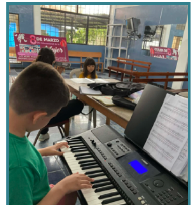
Developing God's gifts & talents