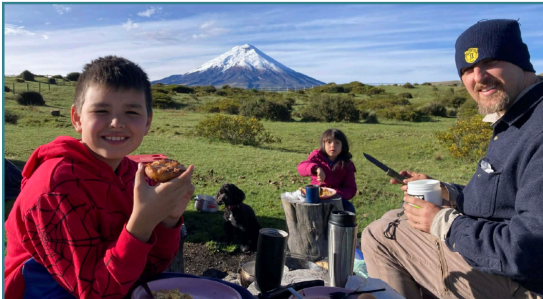
Family outing at Chimborazo

Continue praying for us that the Lord would direct our efforts according to His will and that He would open the hearts of the people to receive the message of the love of Jesus. Thank you for all you do for us!