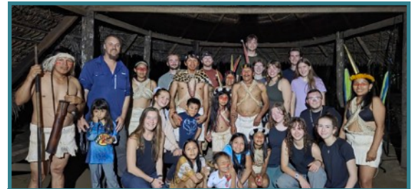
Expeditions group in Gomataon

Over the last few months, we have been visiting and sharing in the villages of Gomataon , Tepepare , and Tzapino . The people are always receptive and grateful. We also hosted the Expeditions Unlimited team that helped build a bridge to the children's new schoolhouse in the community of Gomataon . It is always fun to see the cross-cultural interaction between the students and the indigenous folks.