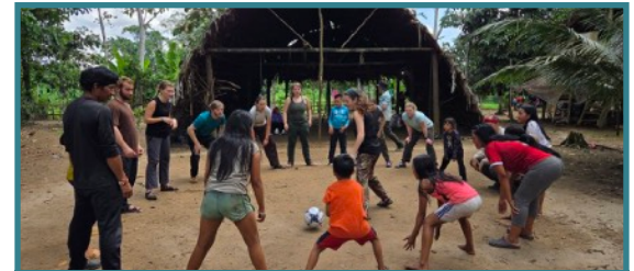
Games with jungle kids