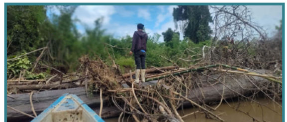
Tricky travel on jungle rivers