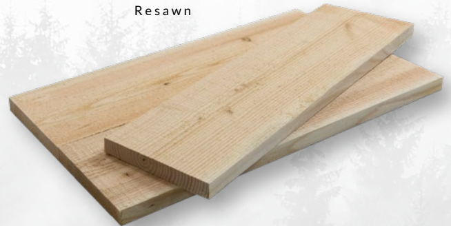
ROCKY MOUNTAIN DOUGLAS FIR Resawn

Make Complicated Simple™ with a wide range of T&G, Shiplap, and siding profiles.