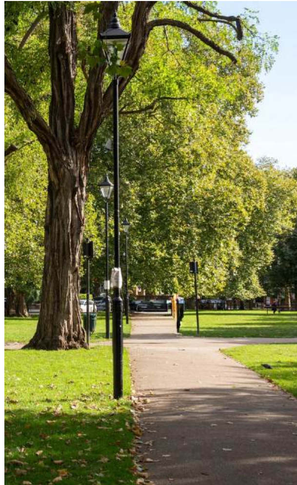
Parsons Green Park – the neighbourhood's leafy centre

Enjoy relaxed walks through Parsons Green Park, coffee in neighbourhood cafés, weekend gatherings in traditional pubs, and easy shopping along Fulham Broadway just moments away.