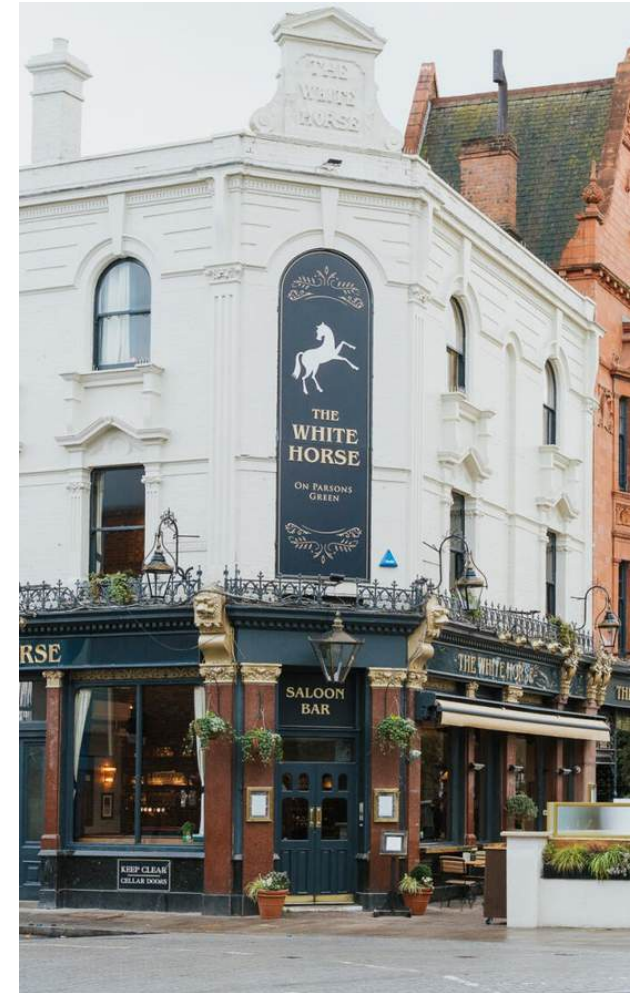
Tree-lined streets with independent cafés and local favourites