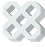
4-16-16 Perk/Turf Block (#XXX)