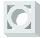
4-16-16 Circle-In- Square (#171)