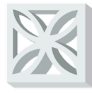
4-12-12 Flower (#399)