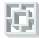
4-12-12 Square-In- Square (#397)