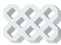
4-16-24 Perk/Turf Block (#XXX)