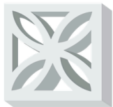
4-16-16 Flower (#XXX)