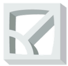
4-12-12 Design (#410)

BREEZE BLOCK ® is available in 10 Standard Shapes