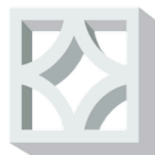
4-12-12 Diamond- In-Square (#377)