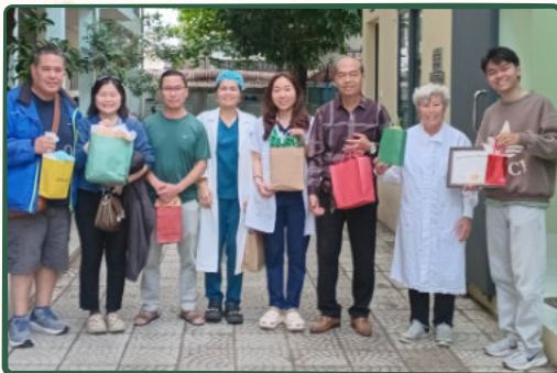
Everyone, thank you for the outstanding volunteer work.

We encourage you to share our work with your family and friends. Thank you for being part of this journey.