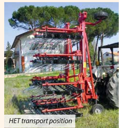
HET transport position

Note: For the operation of the weeder harrow HET hydraulically foldable the tractor has to be equipped with 1 double-acting unit.