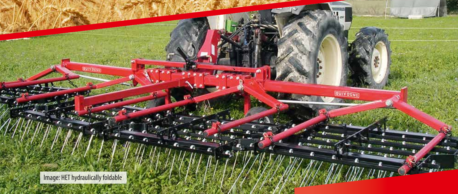
Image: HET hydraulically foldable