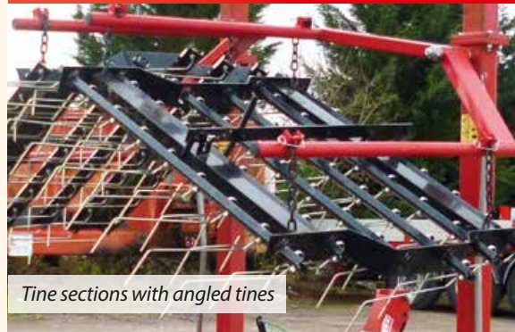
Tine sections with angled tines