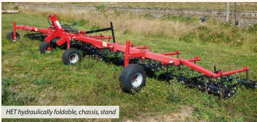
HET hydraulically foldable, chassis, stand