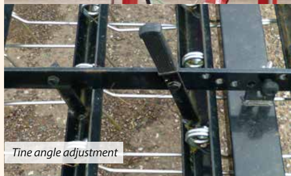
Tine angle adjustment