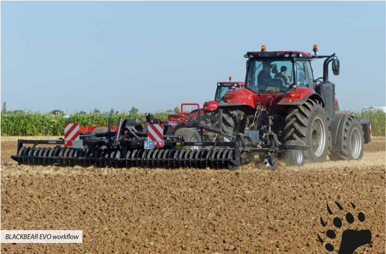
BLACKBEAR EVO workflow