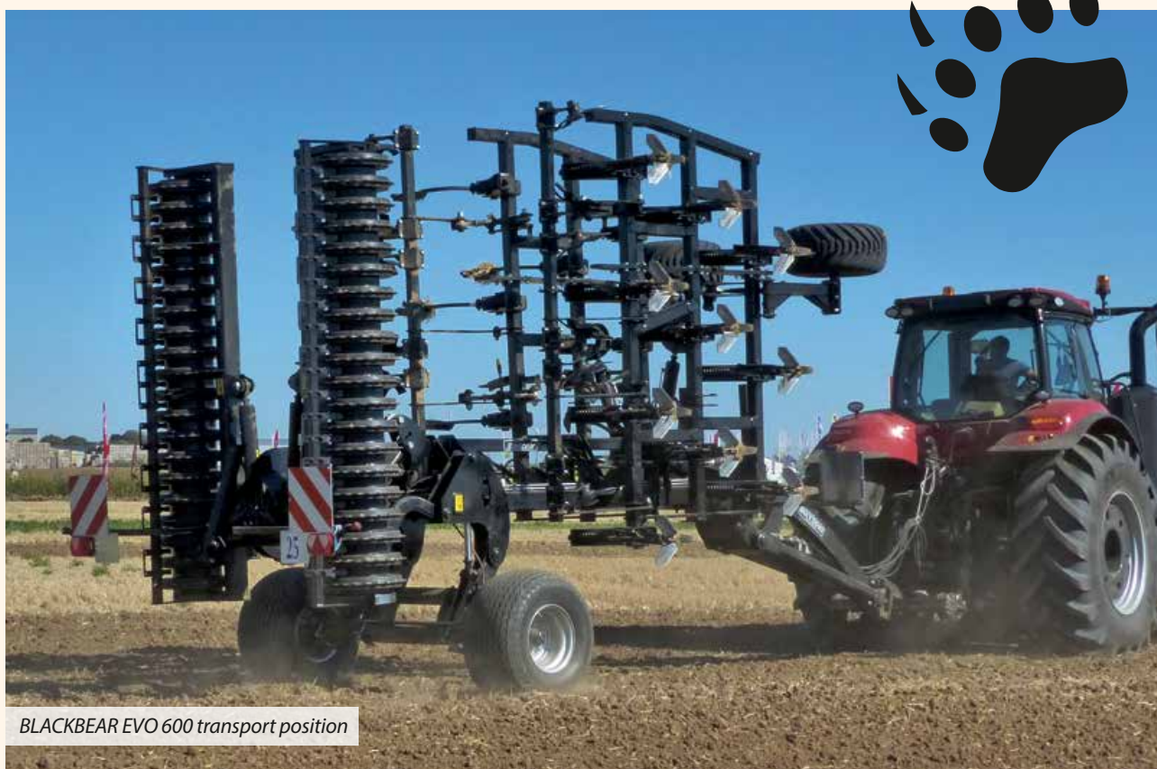
BLACKBEAR EVO 600 transport position