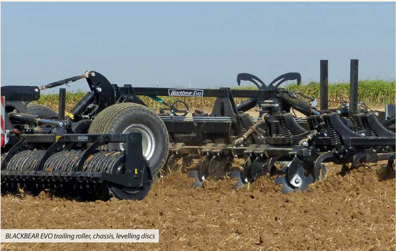
BLACKBEAR EVO trailing roller, chassis, levelling discs