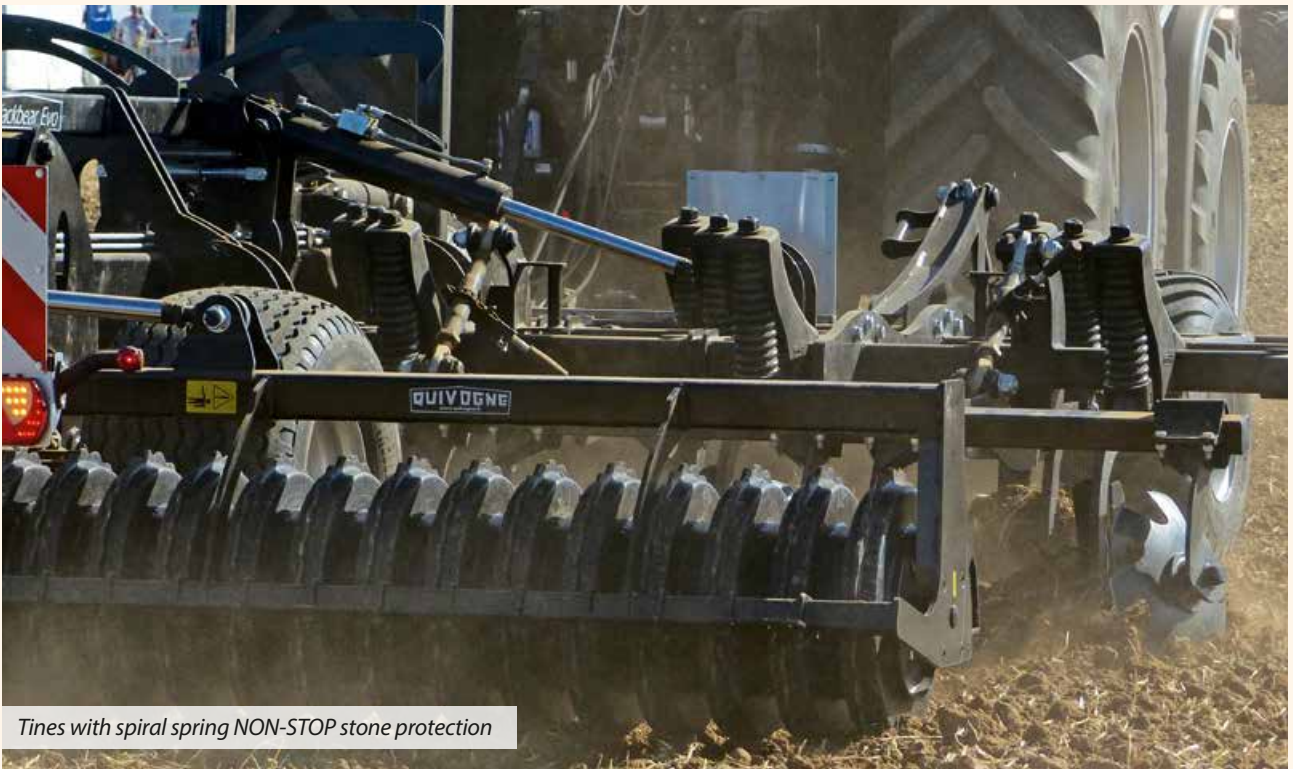
Tines with spiral spring NON-STOP stone protection