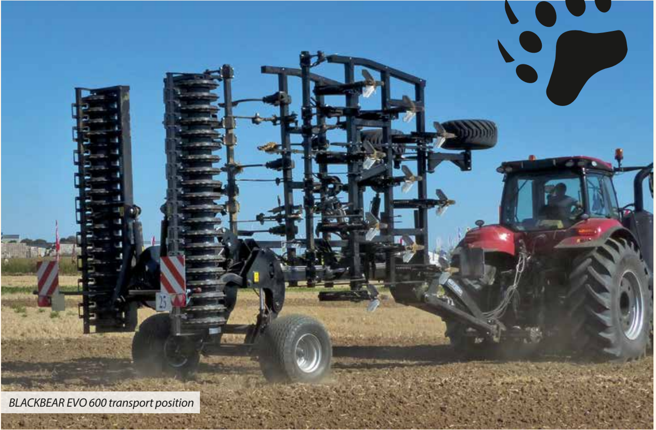
BLACKBEAR EVO 600 transport position