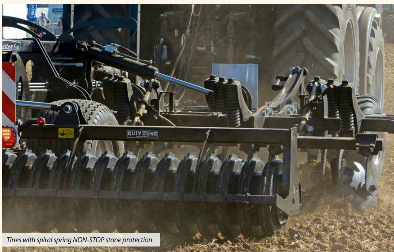
Tines with spiral spring NON-STOP stone protection