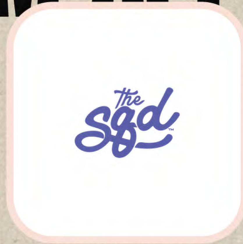
CHURCH MEDIA SQUAD