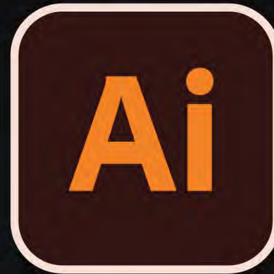
TEXT TO GRAPHIC