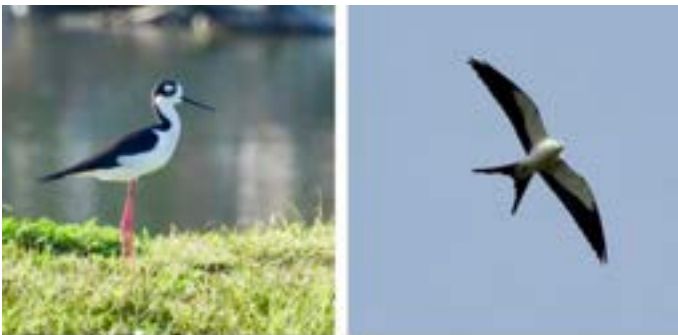
Black-necked stilt (l) and swallow-tailed kite