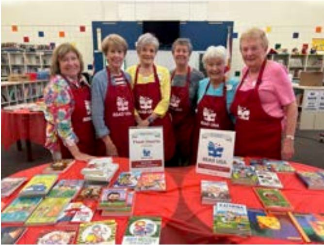
Fleet Hearts helping with the annual READ USA Book Fair at Anchor Academy.