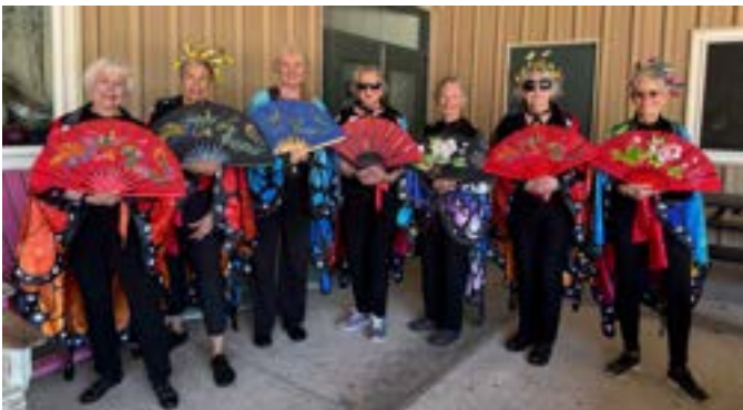
Fleet Landing's Fan Tai Chi troupe

More than 20 Fleet Landing residents joined practitioners across the Jacksonville area on Saturday, April 25, to mark World Tai Chi Day. This is an international event observed in over 80 countries on the last Saturday in April at 10 am local time. The coordinated start is intended to create a rolling "wave" of harmony that travels around the globe as day breaks through successive time zones.