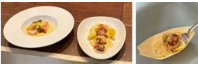
Left: Examples of plating of the dish.