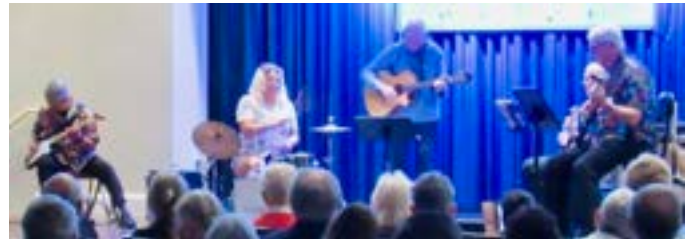
The finale: "Old Time Rock and Roll"