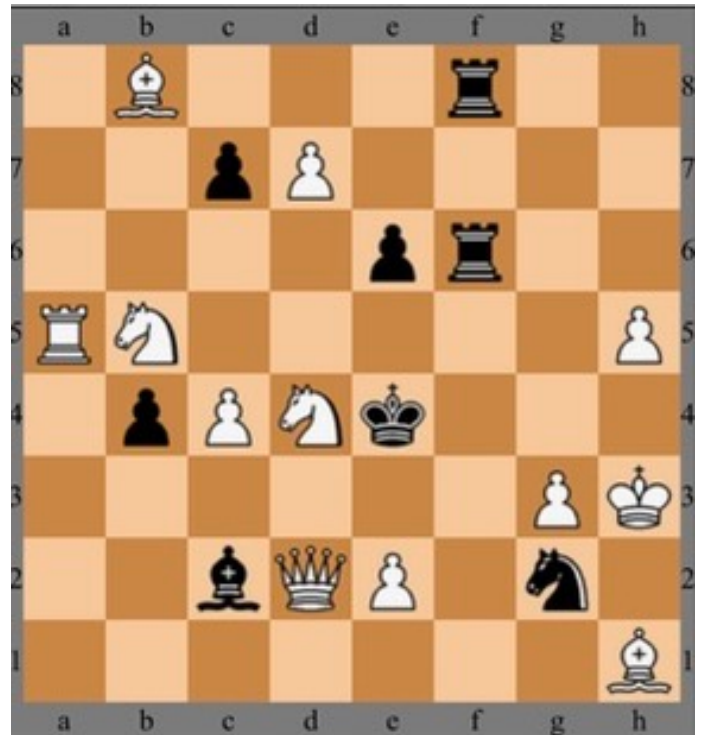
Two chess problems: White mates in two moves Chess tip: Knights post near the center, not on the side.