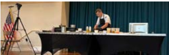
View from in front of the tables