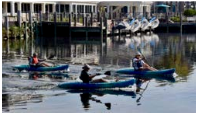
Kayak Race: Men