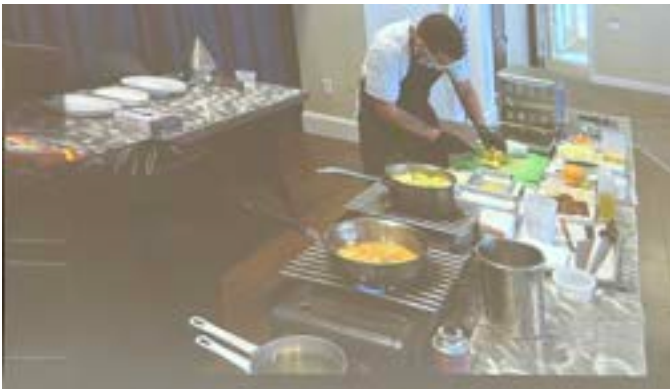
View from behind the tables as seen on the screens