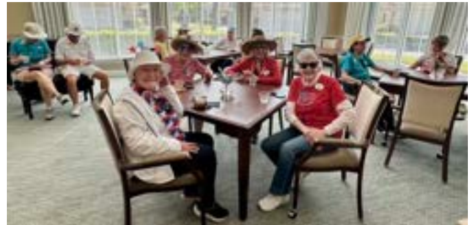
Enjoying refreshments after the parade