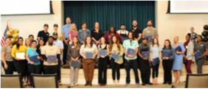
Scholarship recipients able to be present for the ceremony