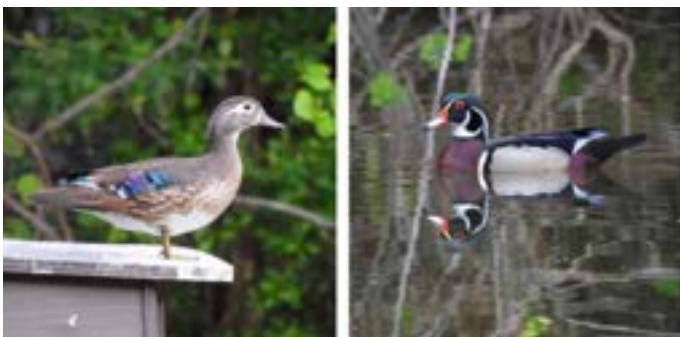
Female wood duck (l) and male wood duck