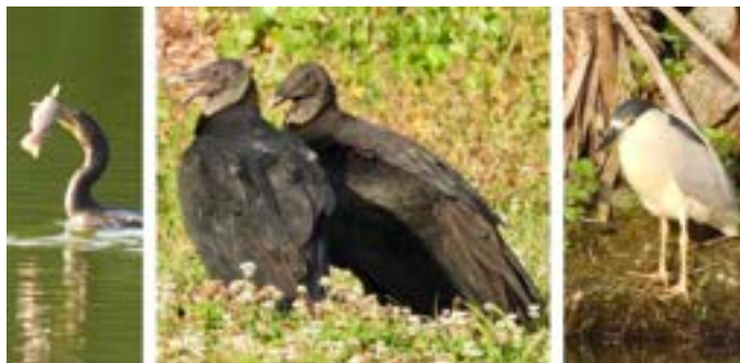
Anhinga with catfish (l), black vultures (center), black-crowned night heron