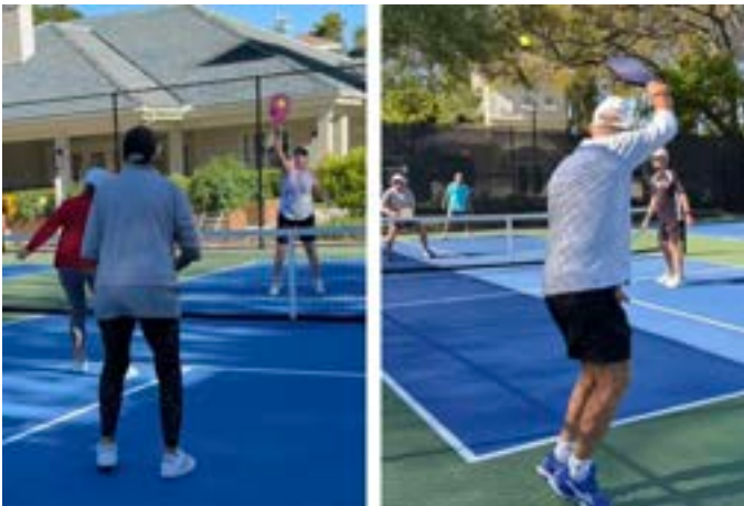
Pickleball: Women's Doubles (l) and Men's Doubles