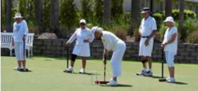
Croquet Semi-final Match

There were so many games that it was not possible to have a photographer at each one. Below is a selection of scenes from the competitions the photographers were able to attend.