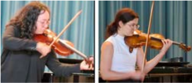
Bach violin soloists