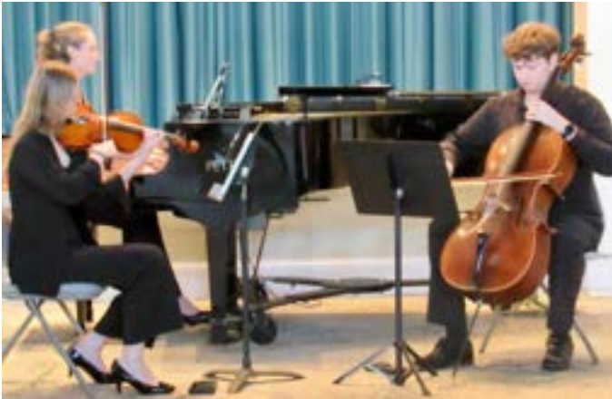
Beethoven piano trio