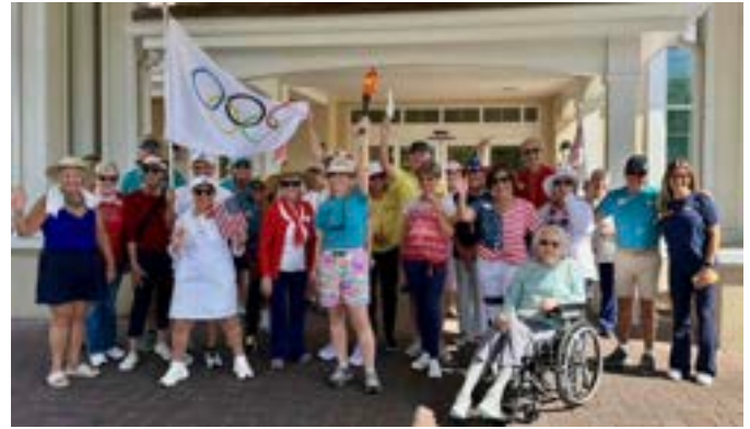
Arrival at Windward Commons

It was another signature event at Fleet Landing, where staff and residents make every day a victory lap.