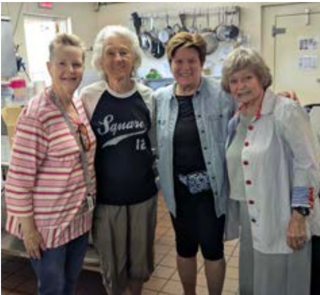
Fleet Hearts at Mission House

Fleet Hearts volunteers remained actively engaged throughout April, continuing their service both on campus and in the surrounding community. The month began with the group's regular Salvation Army donation pick-up on April 6.