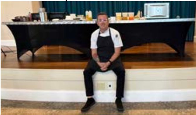
Chatting with the audience before the demonstration began