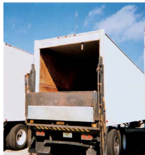
Restrain a variety of trailers, including those with hydraulic lift-gates.

Simple, reliable mechanical design allows for minimal maintenance with self-lubricated rollers, bushings and few moving parts. The easily-installed surface mounted MWL-1300 Wheel-Lok™ optimally performs in all-weather conditions.