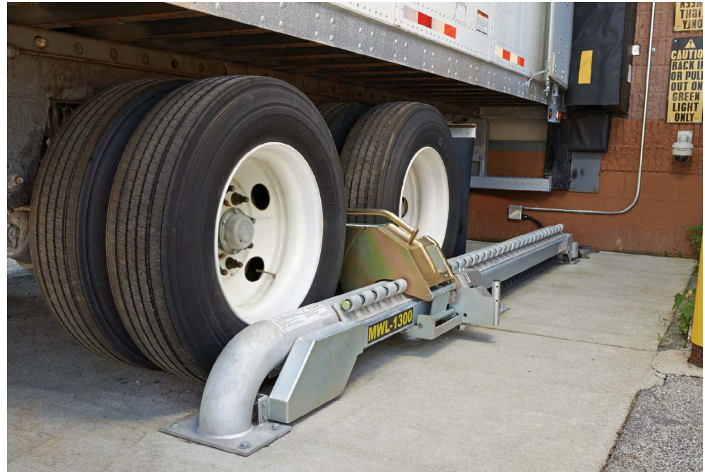
MWL-1300 Wheel-Lok™ engaged

Dok-Lok® vehicle restraints help physically enhance security when the control package is linked with an active building security system. If an engaged restraint is tampered with, the building security system is notified and facility protocol is followed.