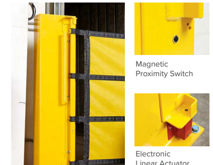
Secondary Assist Handle