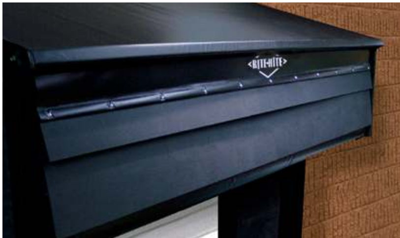
Layered Neotec HMWPE impact plates can take thousands of trailer hits without damage.