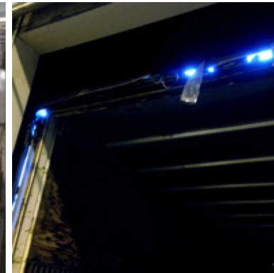
Trailer tops are notoriously difficult to seal.