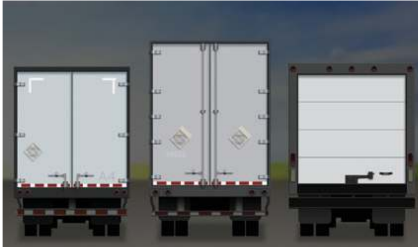
15" (381 mm) coverage range allows RainGuard to seal more trailers, more of the time.