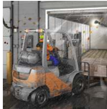
Inadequate sealing can let wind, rain, dust, and bugs into your facility and allow expensive energy to escape.