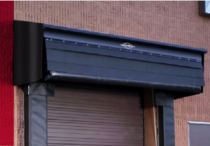
Rite-Hite® RainGuard Header Seal.

The RainGuard trailer top seal uses a weighted, cylindrical foam sealing member that provides 100 lbs. (45 kg) of constant pressure to maintain consistent contact with trailer as it bounces up and down during loading and unloading. This creates a dam to prevent water from reaching the dock and forms a barrier against light, dust, bugs, and wind.