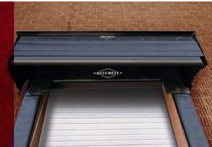
RainGuard is designed to work with virtually any existing dock seal or shelter.