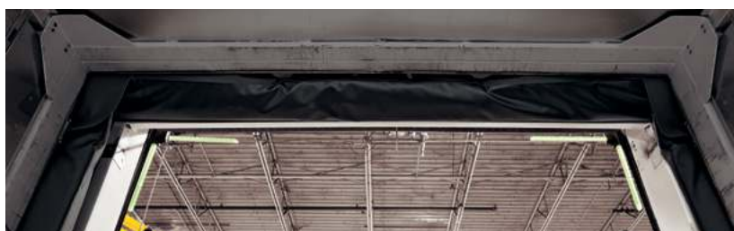
High performance head pad features layers of light-blocking pleats to effectively seal these trailer protrusion gaps. (View from inside trailer.)