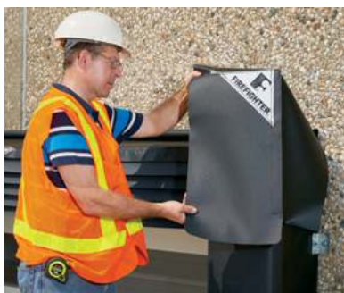
Removable, replaceable corner wear boots.