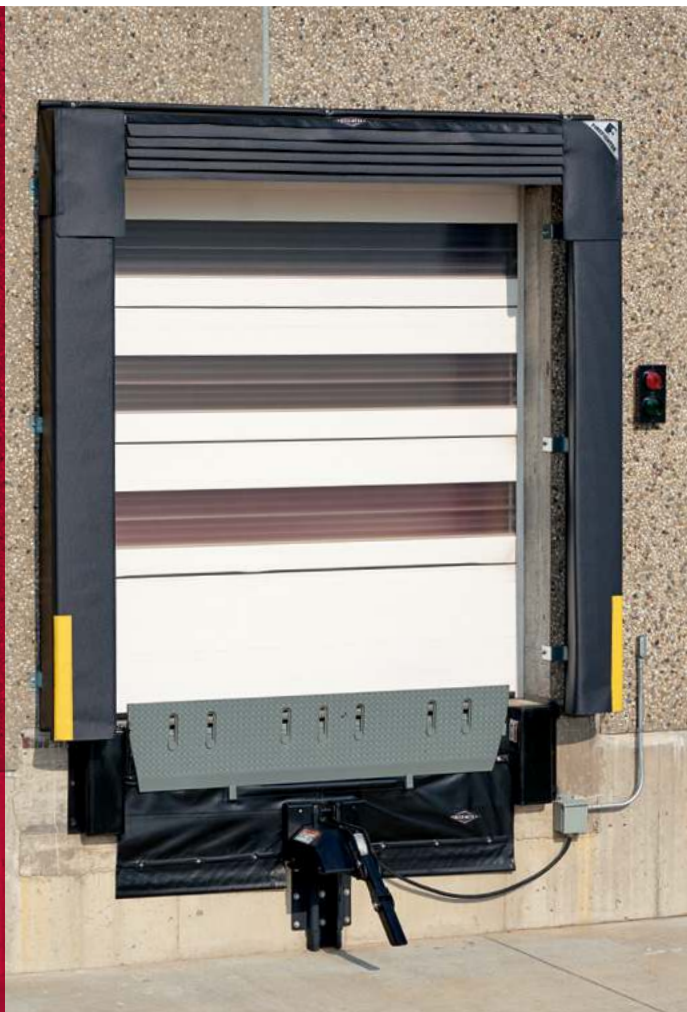
Unit shown with high performance head pad, Durathon fabric on side pad and inside bevel, and optional PitMaster 4th-side sealing system.