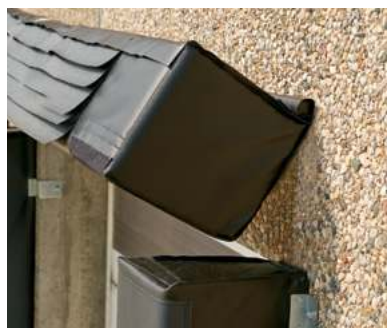
Pivoting, backerless head pad.