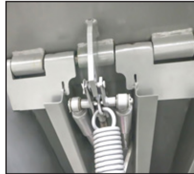
Hydrachek shock absorbers.