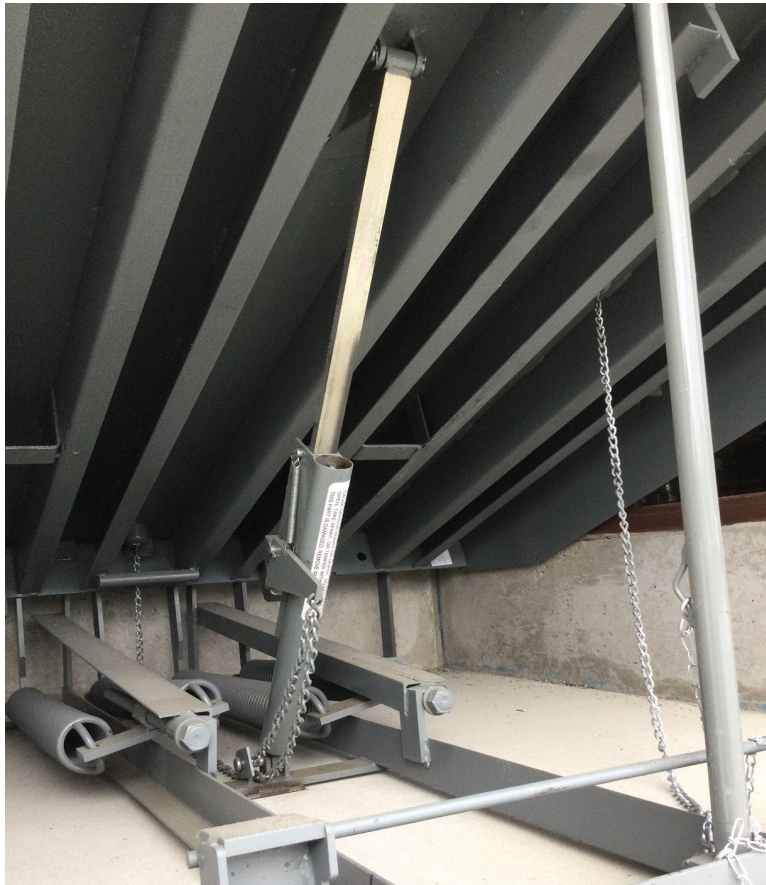
Hold-down device underneath a Rite-Hite® mechanical leveler.

Reliable tooth engagement to help hold mechanical levelers in place for safe loading procedures.