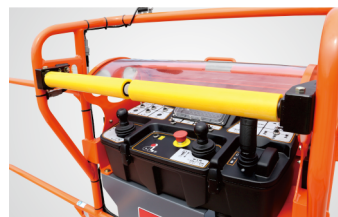
Anti Extrusion Device