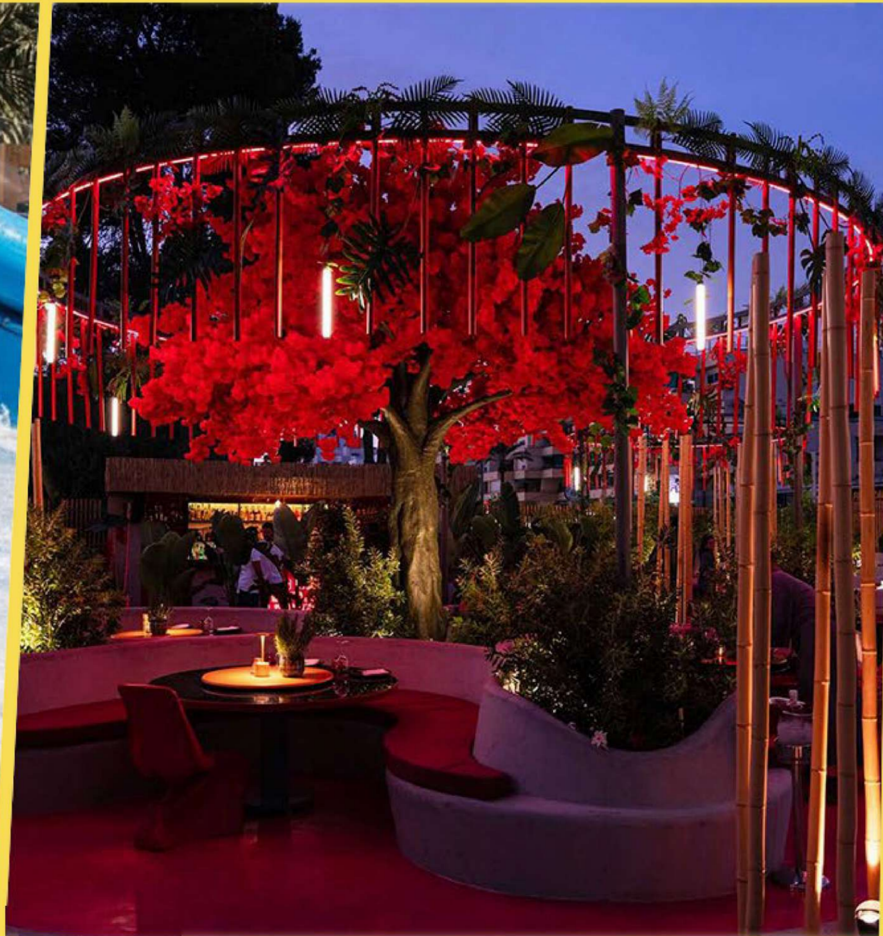
Chee Ke Wun