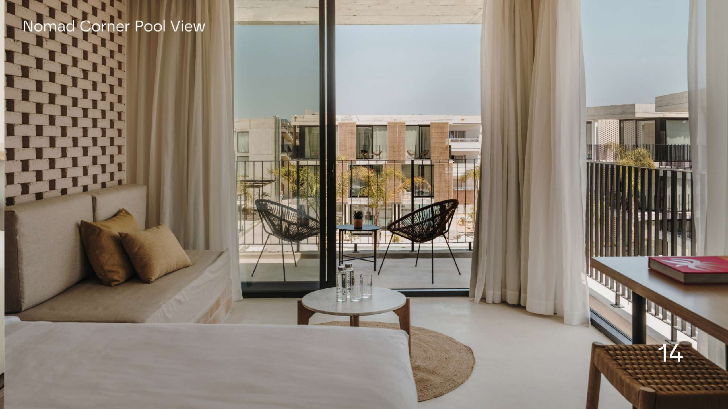
Nomad Corner Pool View