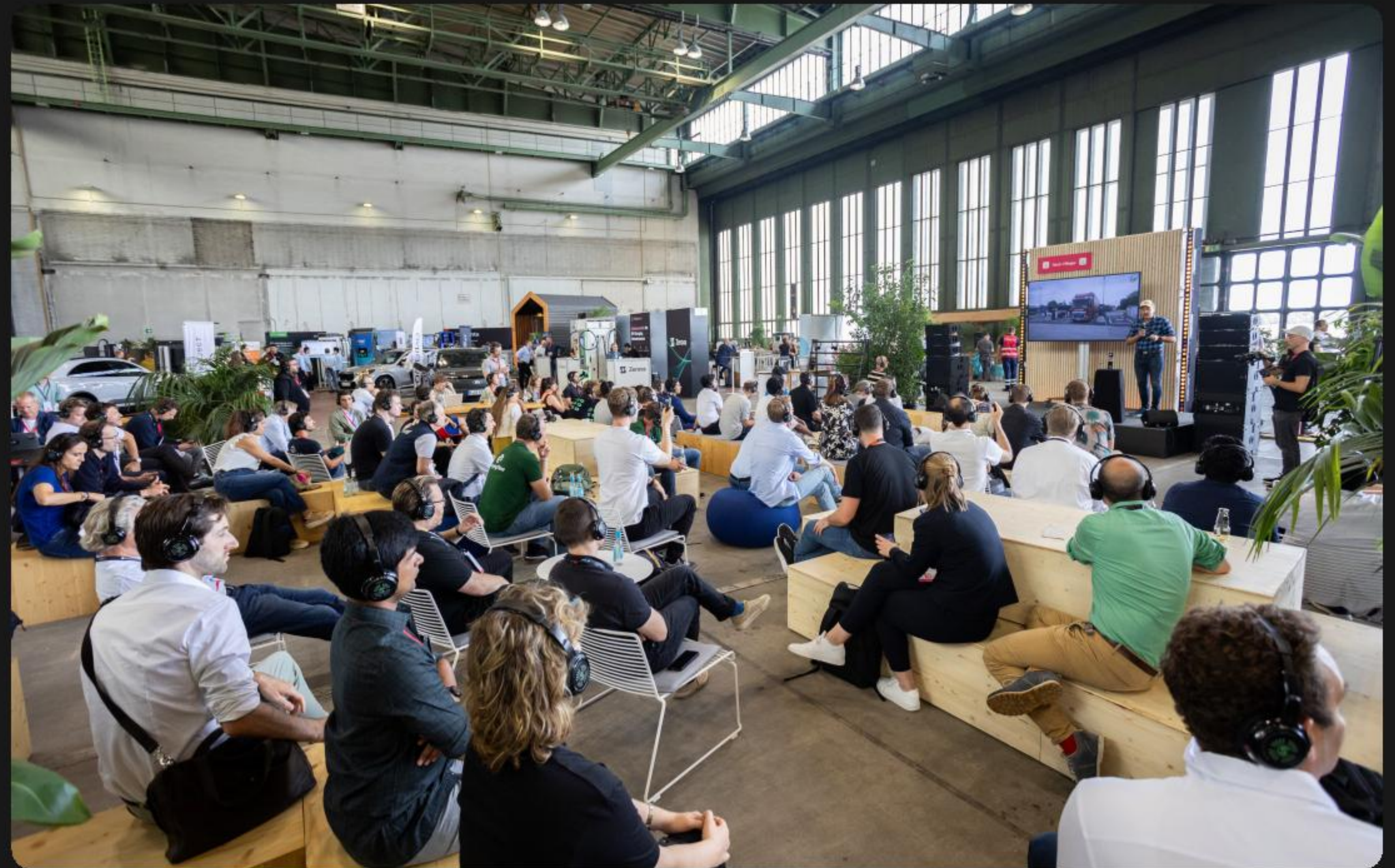
The Tech Village at last years icnc25.