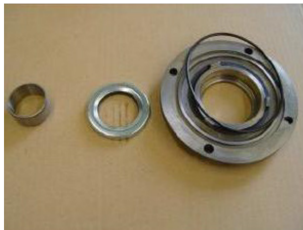
Shaft sealing maintenance kit