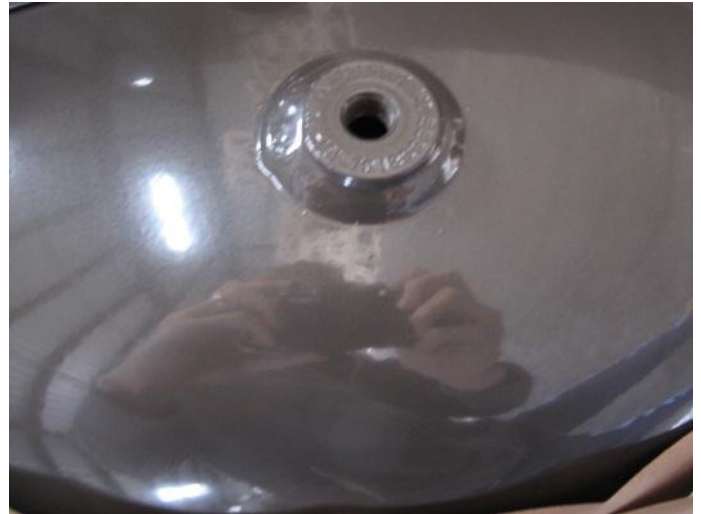
Current pressure switch removed from tank.