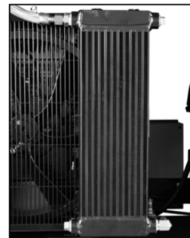
Air cooled after cooler on Platinum models