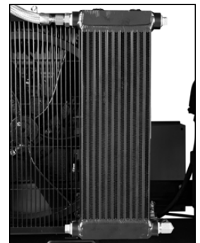
Air cooled after cooler on Platinum models