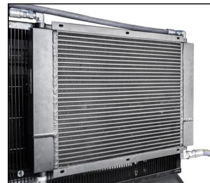
Belt guard mounted air/oil cooler