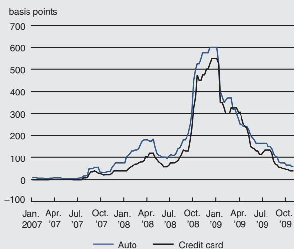
1. AAA three-year fixed-rate ABS spreads

NOTE: AAA is the highest quality rating for asset-backed securities (ABS).