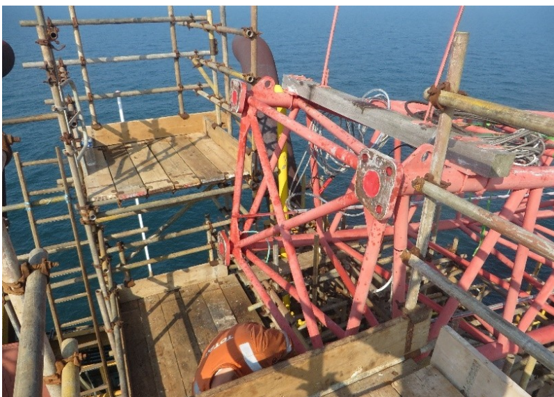
Photo: Deck crane without crane boom tip