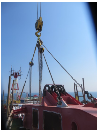
Photo: Lifting configuration attached to the old crane boom tip