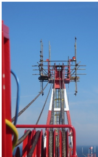
Photo: New crane boom tip