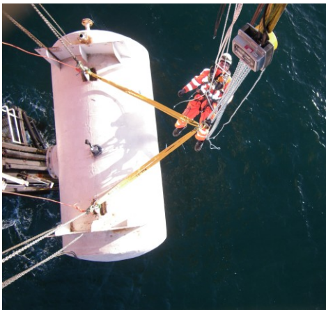
Photos: Rigging and offshore lifting of the diesel tank