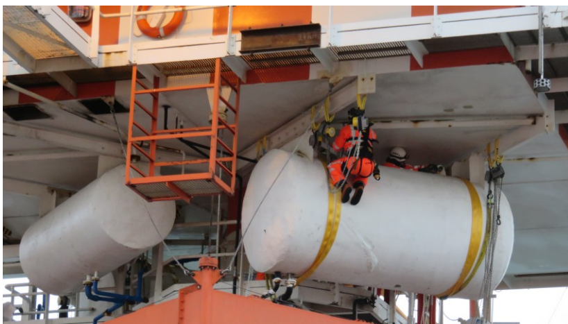
Picture: Preparing rigging old diesel tank

Each tank weighs approximately two tonnes, is 1.6 m in diameter and is 4 m long. The tanks are suspended under the Euro platform by means of two top-mounted brackets.