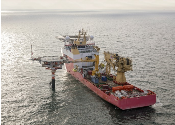
Photo: Normand Reach with crane and walk-to-work gangway