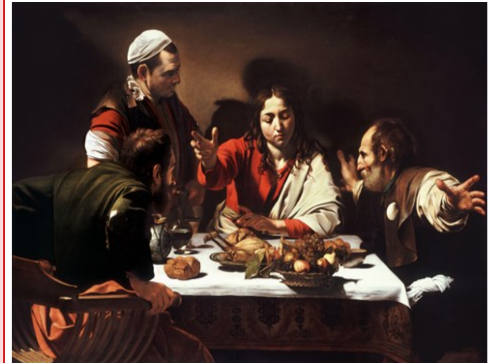
The Supper at Emmaus by Caravaggio