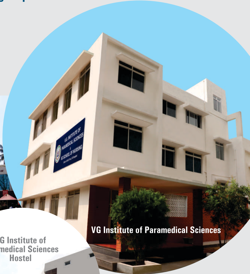
VG Institute of Paramedical Sciences