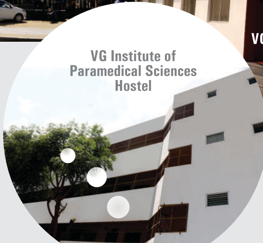
VG Institute of Paramedical Sciences Hostel

We are fully equipped with the most sophisticated operation theatres for surgical procedures specially for Laparoscopy, Gynaecology, Neurology, Urology, Orthopaedics, ENT.,