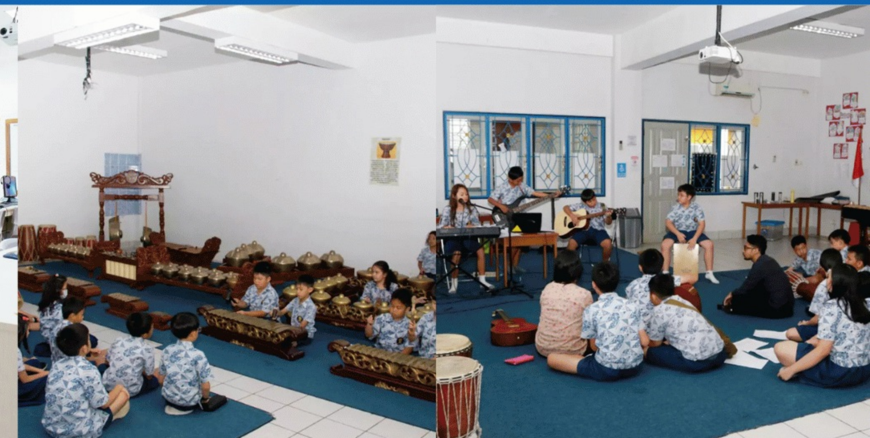
Traditional Music Room