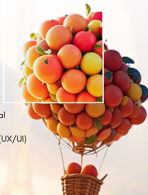
A tangerine-shaped hot air balloon.