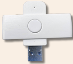
Top of the charger.