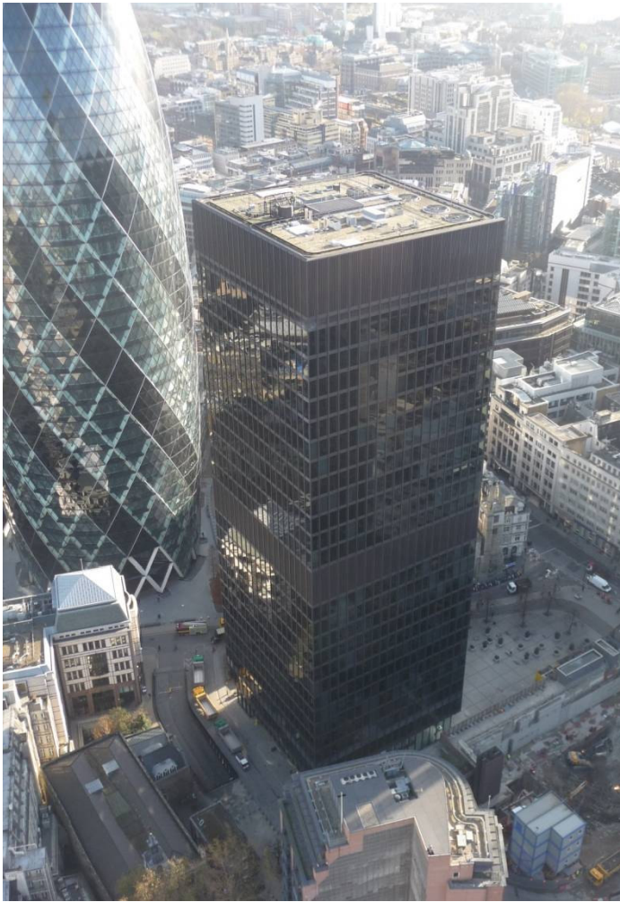
Commercial Union HQ St Helens, 1 Undershaft London EC3