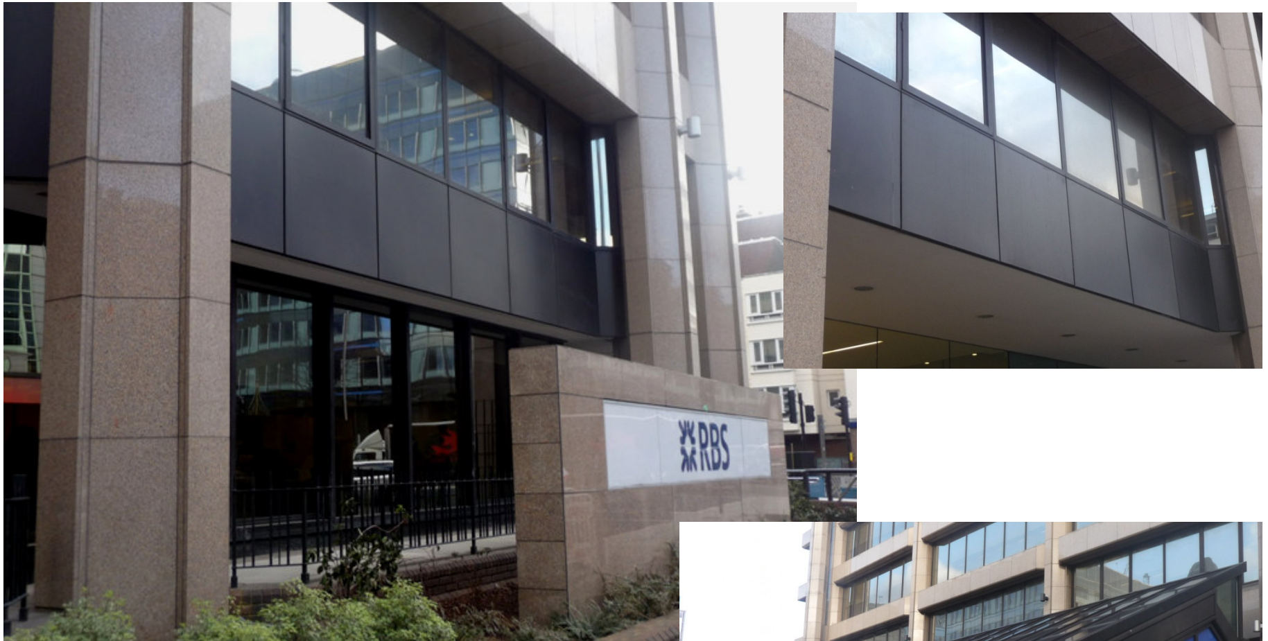
RBS – Aldgate Building (ex. Sedgwick centre) Whitechapel High Street London E1