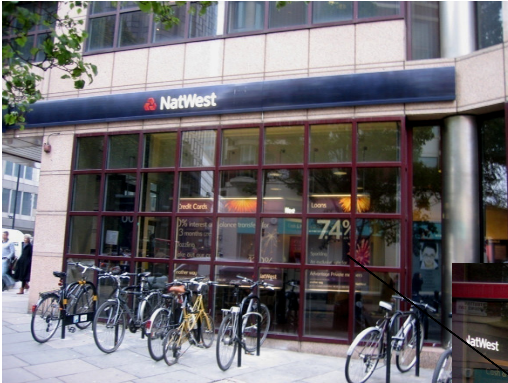
NatWest Bank 55 Victoria Street London SW1