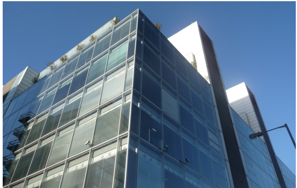
ITN Headquarters 200 Grays Inn Road London WC1