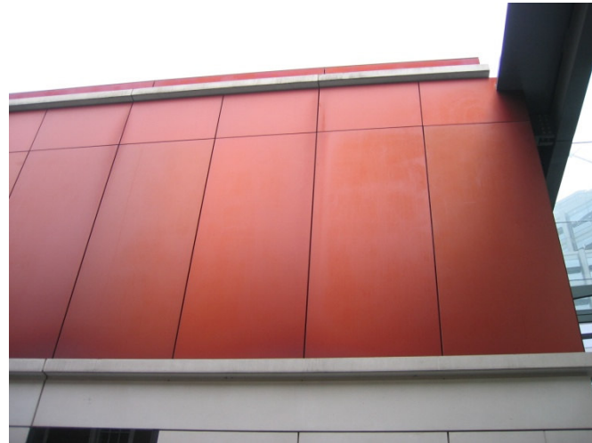
Bishop Square London E1