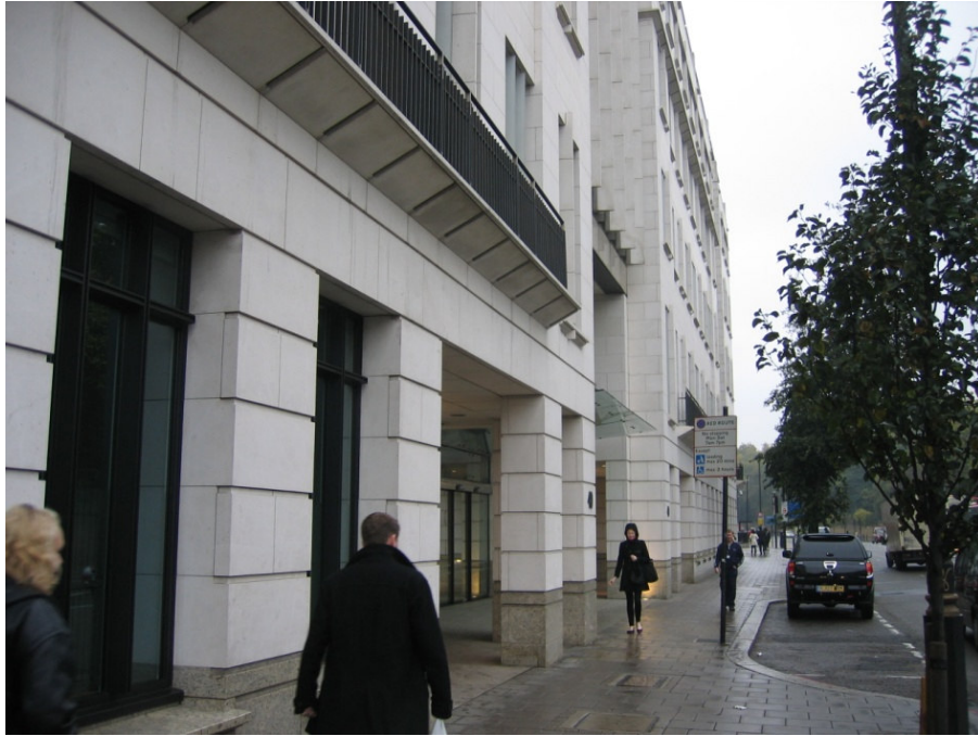
Hobart House 10 Grosvenor Place London SW1