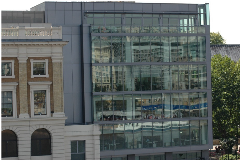
Two London Bridge Southwark London SE1