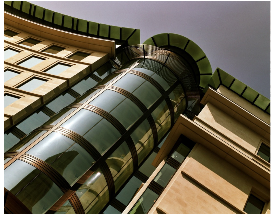
12 Arthur Street London EC4