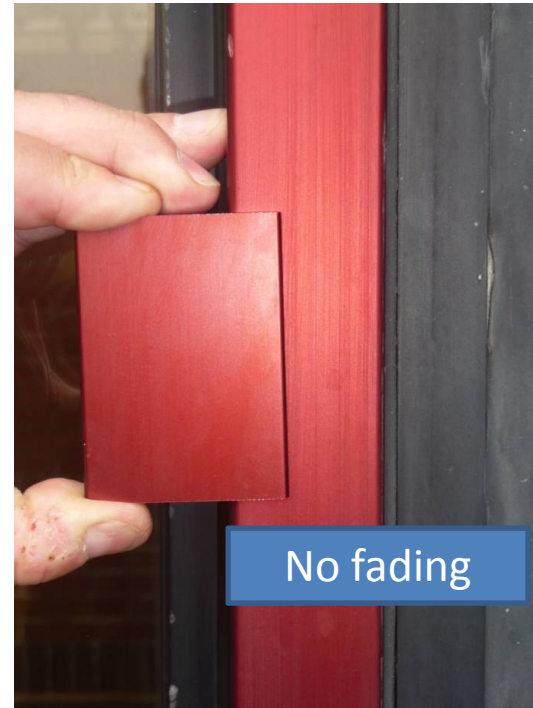
No corrosion on anodised Al