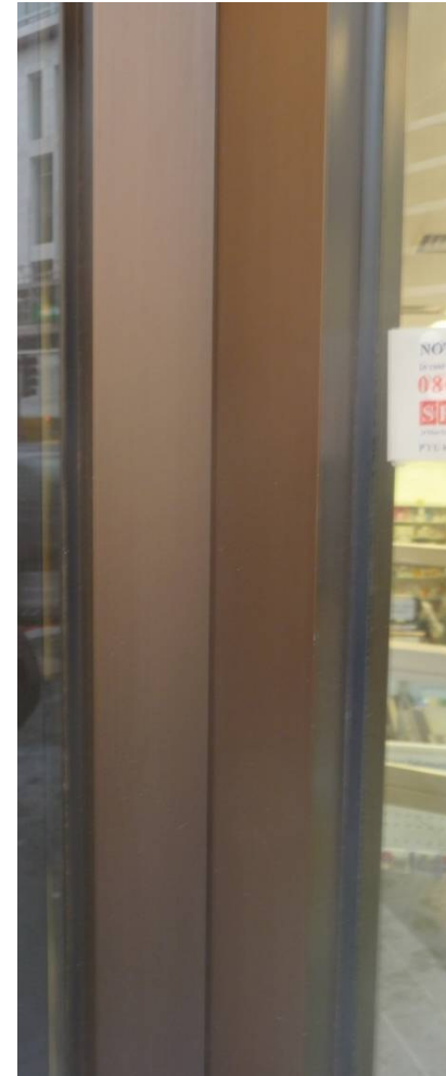
60 Gracechurch Street London EC3