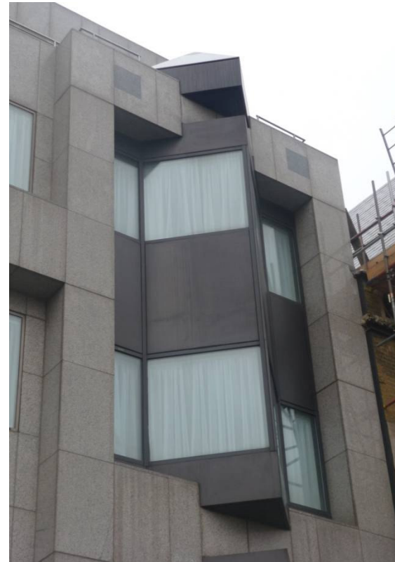
Premier Inn 24 Prescott Street London E1