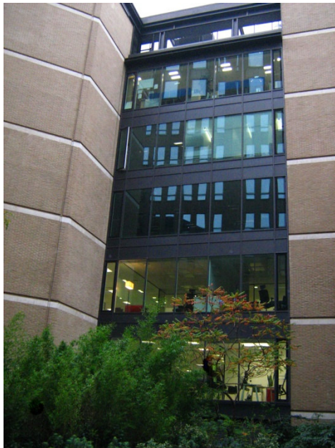
40rty building 3-5 Plough Place London EC4