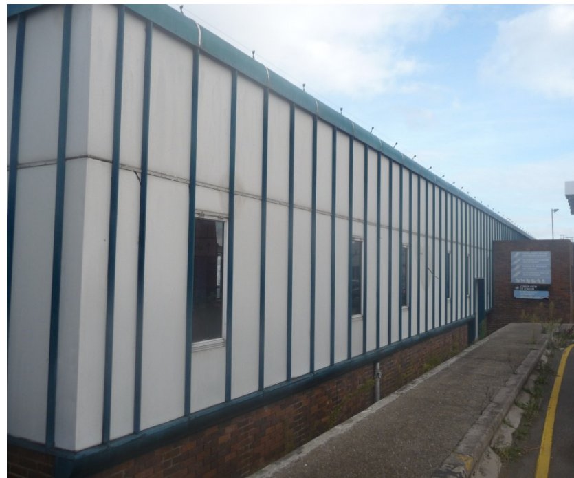
Ex. Olau Line Offices Port of Sheerness Sheerness , Kent