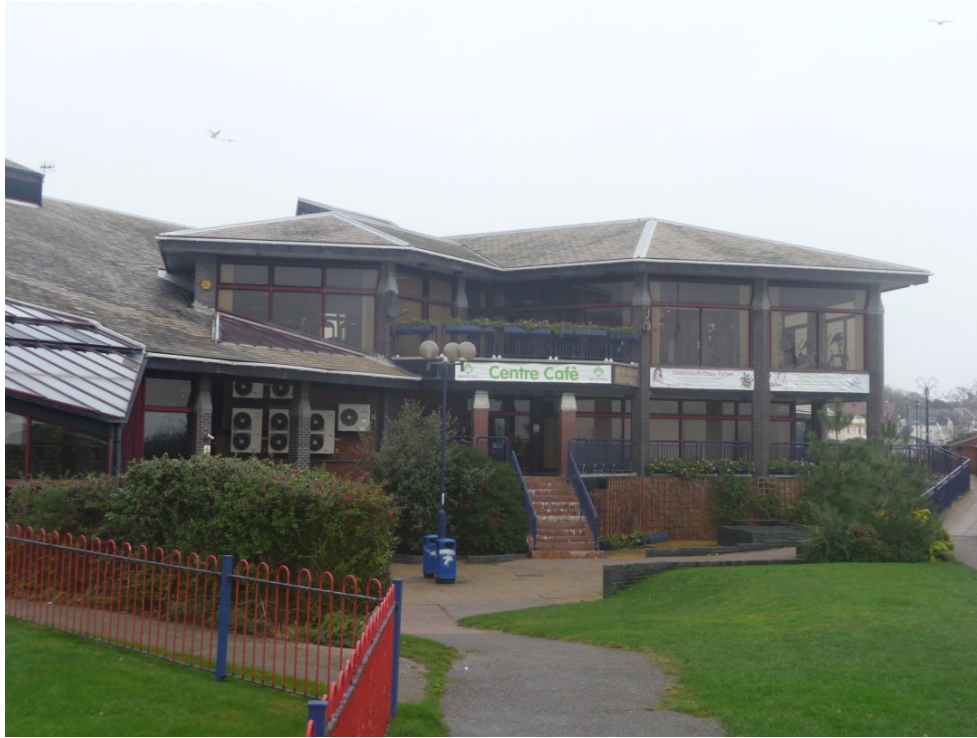
Felixstowe Leisure Centre Undercliff Road West, Felixstowe, Suffolk