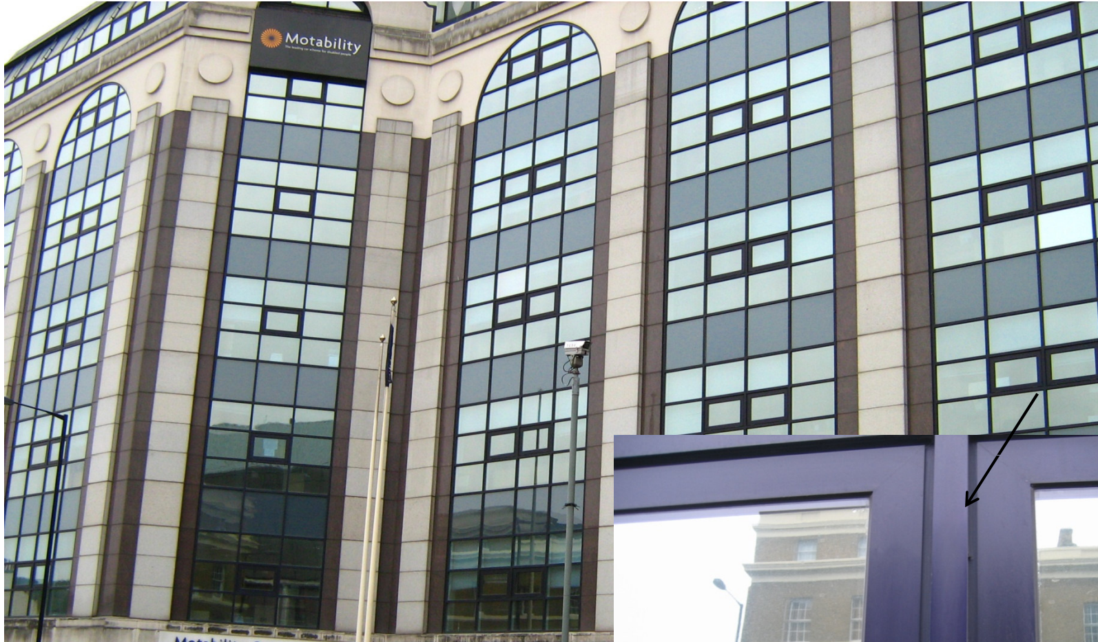
City Gate House 22 Southwark Bridge Road London SE1