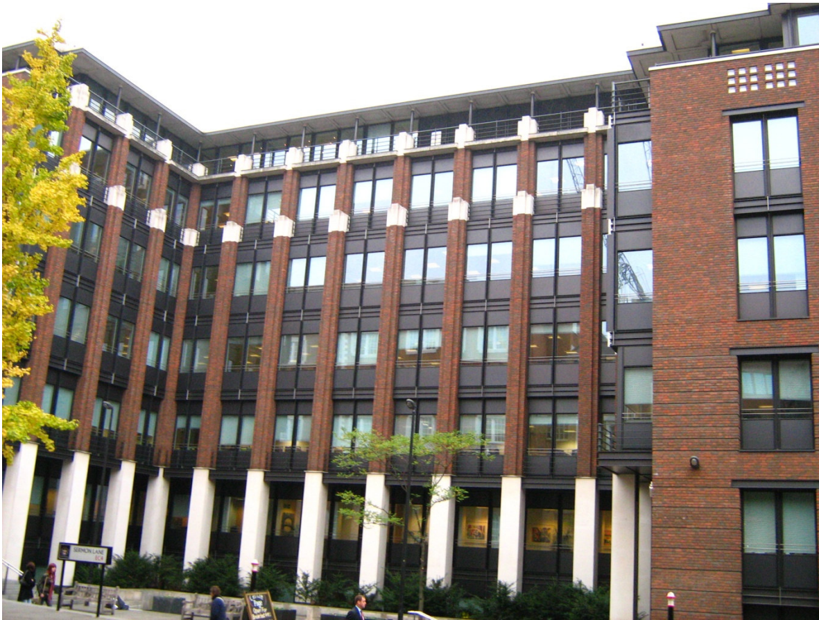
Peter's Hill House 1 Carter Lane London EC4