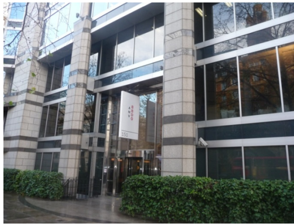
Enford House 191 Marylebone Road London NW1