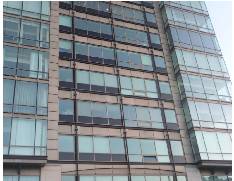
The Panoramic-Rivermill House 152 Grosvenor Road London SW1