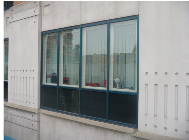
Abbey National Building 21 Prescott Street London E1