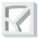
4-12-12 Design (#410)

BREEZE BLOCK® is available in 10 Standard Shapes