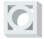
4-16-16 Circle-In- Square (#171)