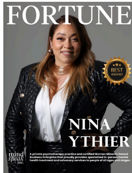
Fortune Magazine (June 2024) Also part of the “Future of Business in New York City” edition.