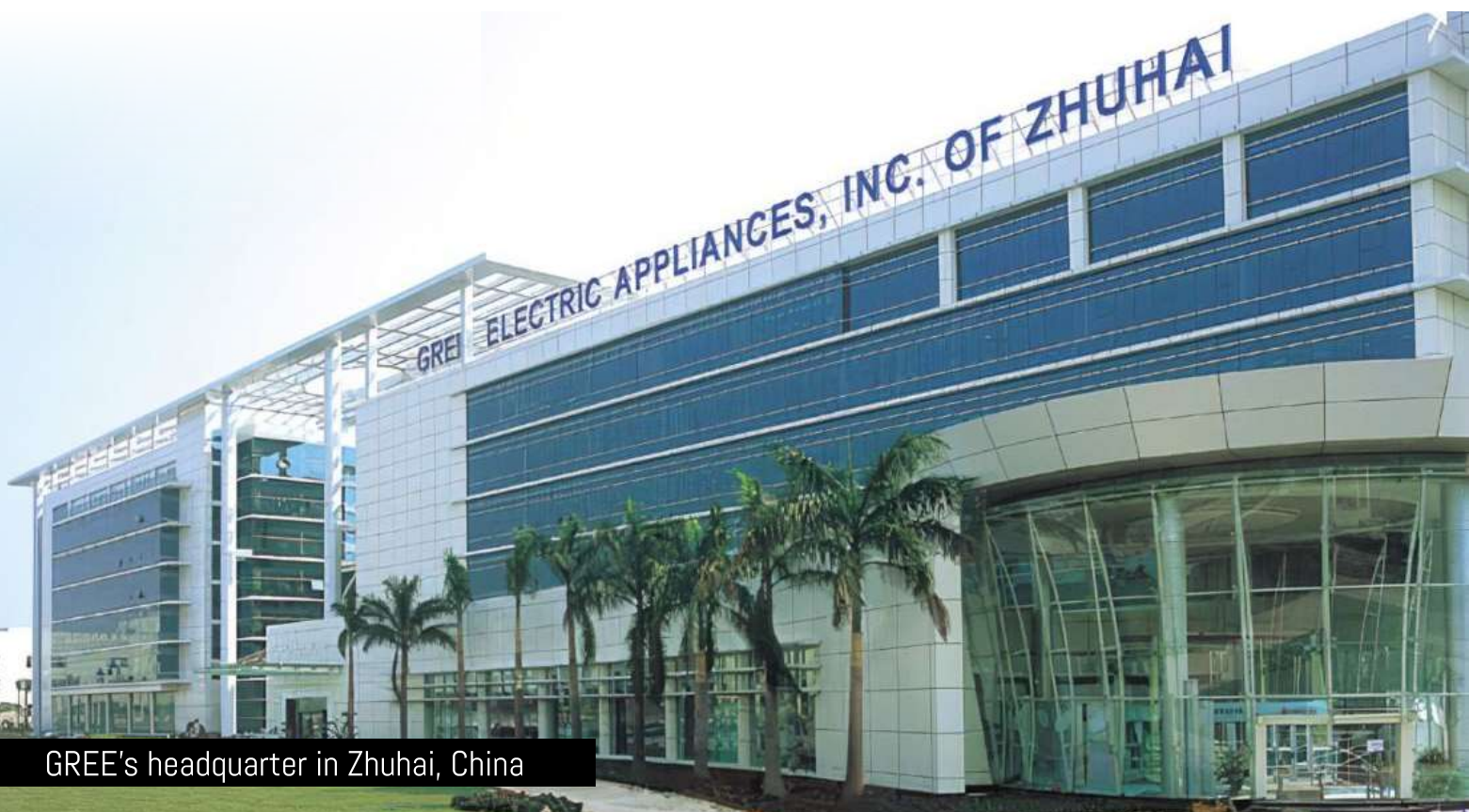
GREE's headquarter in Zhuhai, China

Since 2005, TOSOT has access to the international market and enjoyed a good reputation. By 2014, TOSOT has built up a high-end brand image in dozens of countries in Asia, Europe, Americas, Africa, etc., and gained an advantage in market share. Relying on technology innovation, TOSOT endeavors to improve quality and service, providing a better living solution and user experience. TOSOT, made in China, loved by the world.