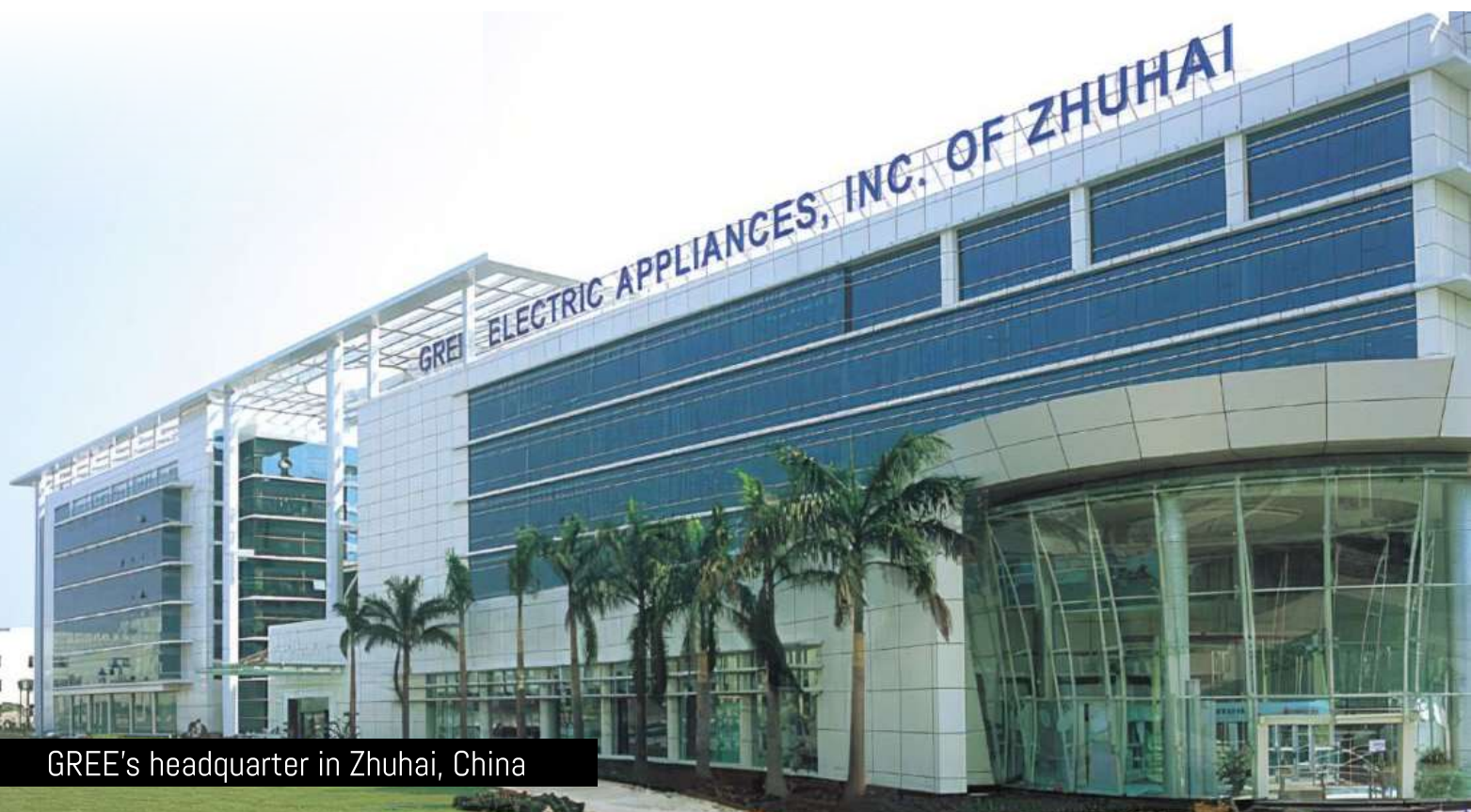
GREE's headquarter in Zhuhai, China

Since 2005, TOSOT has access to the international market and enjoyed a good reputation. By 2014, TOSOT has built up a high-end brand image in dozens of countries in Asia, Europe, Americas, Africa, etc., and gained an advantage in market share. Relying on technology innovation, TOSOT endeavors to improve quality and service, providing a better living solution and user experience. TOSOT, made in China, loved by the world.