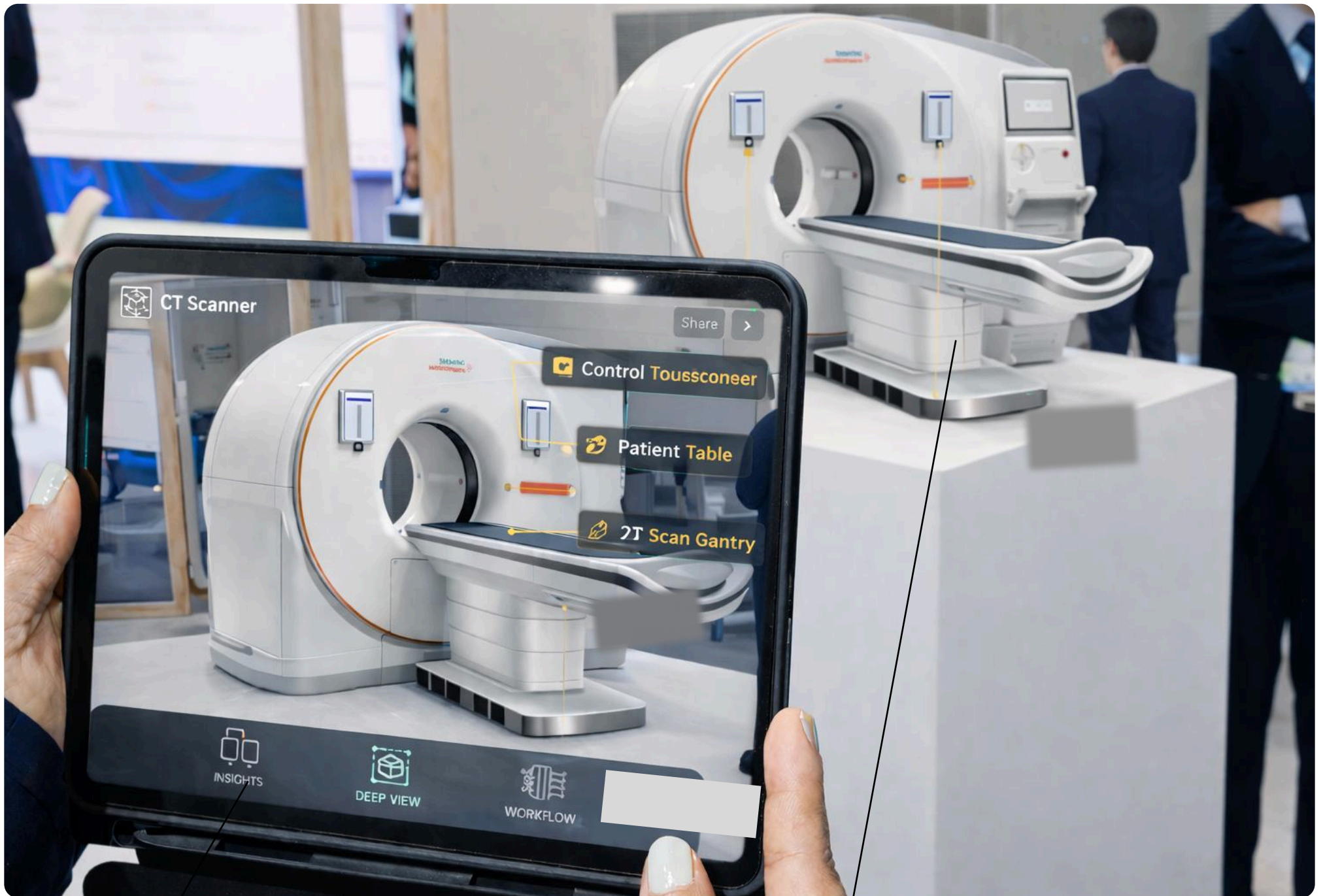
Internal X-Ray View with Ipad