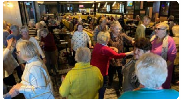
SSG Relax, SSG Sport and CBR Doveton

The first day of June was a day full of laughter, good food and crazy dancing at Morning Melodies at the Hallam Hotel