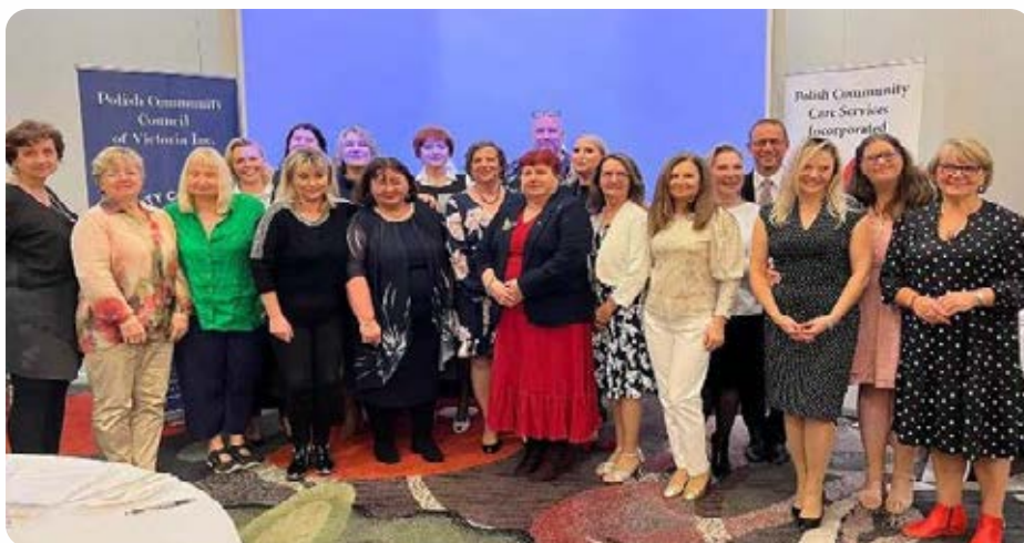
Cert IV and III Graduates