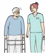
Transport & assistance with shopping