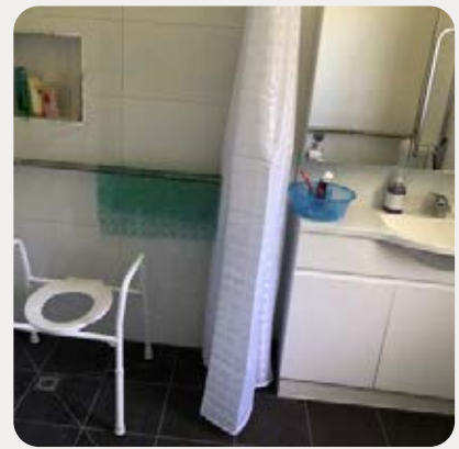
Photo 1: Lucyna stayed at Crib Point for over 3 weeks. Photo 2: Lucyna working with a Physiotherapist via NDIS funding. Photo 3: Lucyna's new bathroom renovated via NDIS funding.