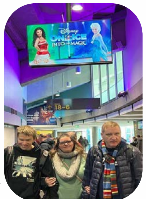
Rewia Diisney on ice