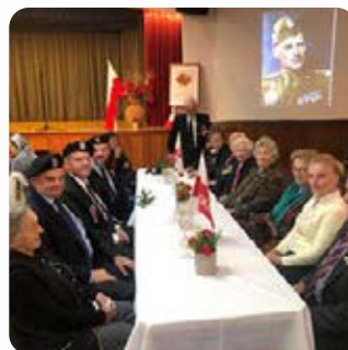
Photo 1 – members of the Polish Ex-Servicemen's Association Branch No. 3