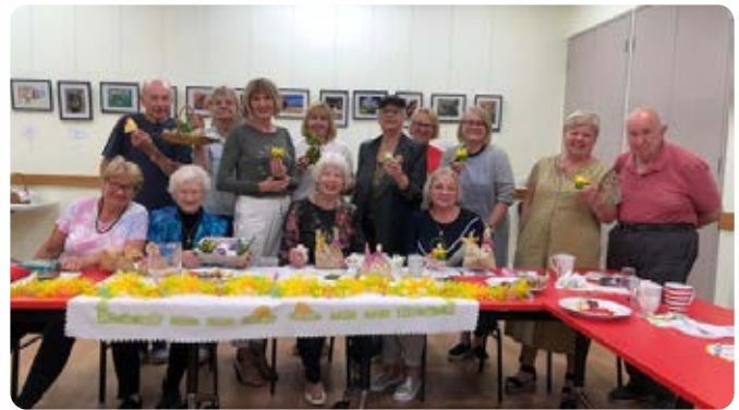
CBR Highett II