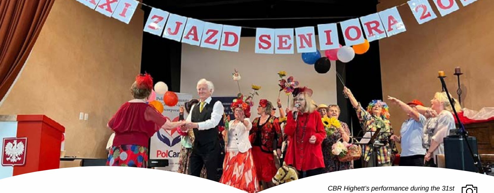
CBR Highett's performance during the 31st Seniors' Day at the John Paul II Polish House in Ardeer, October 19, 2022