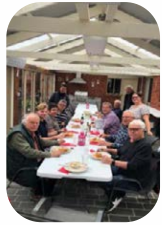
Photo 1: Our participants having fun at a disco! Photo 2: Ballarat Conference/Camp. Gold mine, Light and sound show. Photo 3: Working together at the Mens Shed, Crib Point. Photo 4: Enjoying home cooked lunch and lovely company at Crib Point.

PolCare implemented the following strategies to control infection transmission: