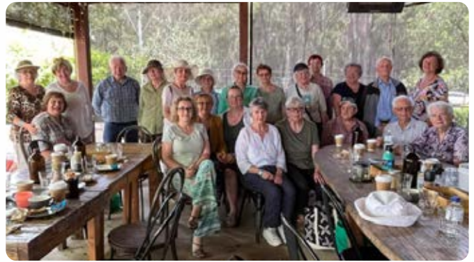
SSG Reservoir and SSG Brunswick