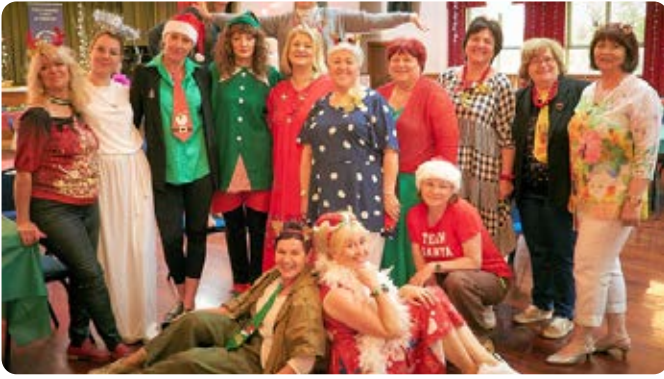
PCCS Team at Christmas Party in Rowville