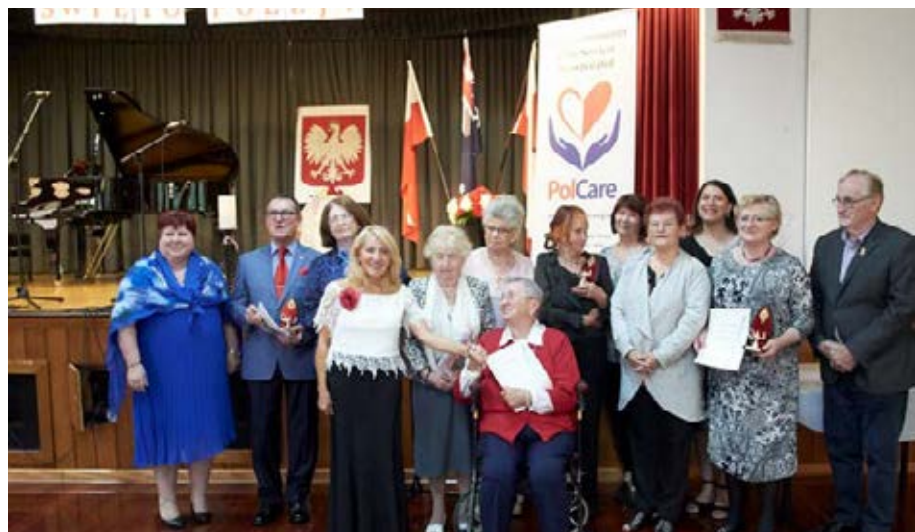
Participants of XX Jubilee Seniors Poems Competition.

XX Jubilee Seniors Poems Competition. Many excellent poems written by our seniors were entered into the competition. Results of the XX Seniors Poems Competition were announced on the 21st of November 2018 during the Seniors' Poems Celebration in Rowville. The winning poems were read out by actors from the "Prób Miniatura" theatre group.