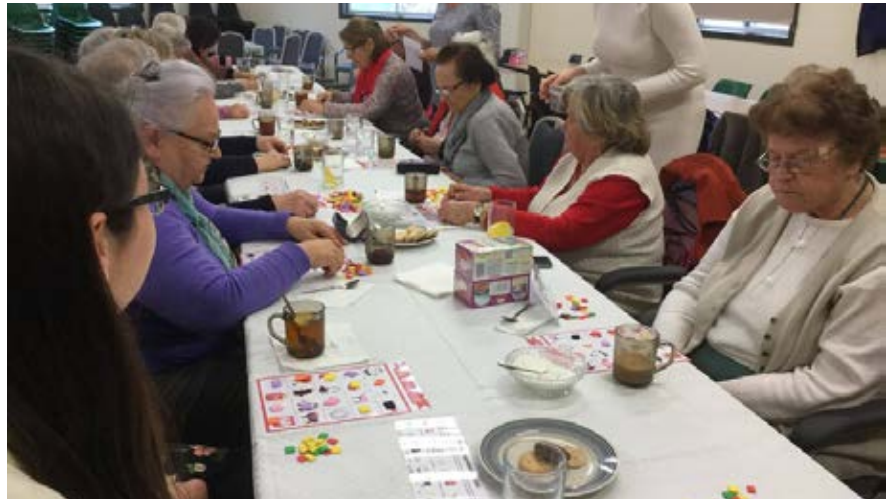
SSG Oakleigh during playing in Bingo.