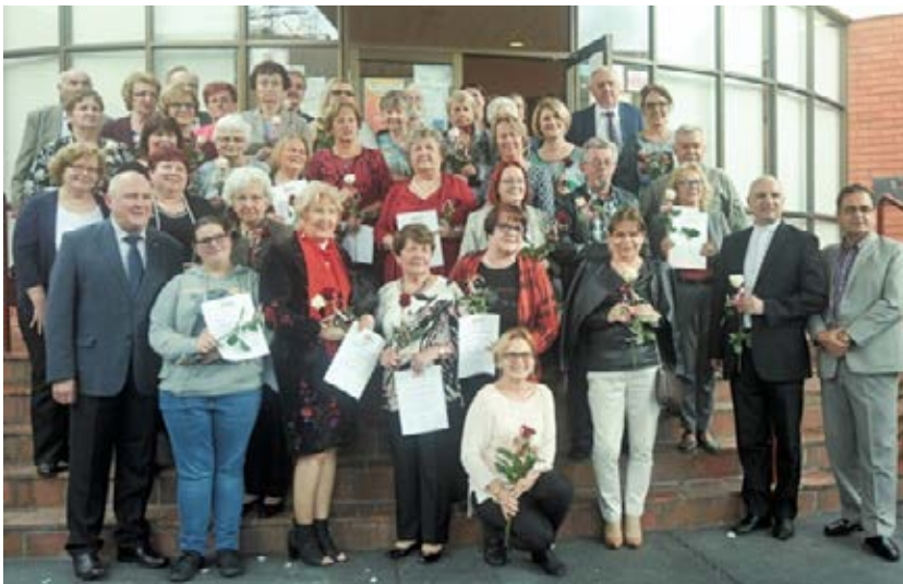
Volunteers of PCCV and PCCS.