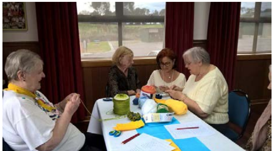
SSG Oakleigh during crocheting.