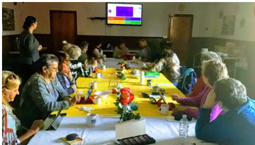
SSG RELAX Rowville during interactive activity with Easter quiz on Kahoot platform.