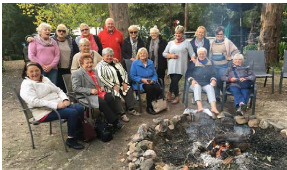
SSG SPORT Rowville in Polana Camp in Healesville.