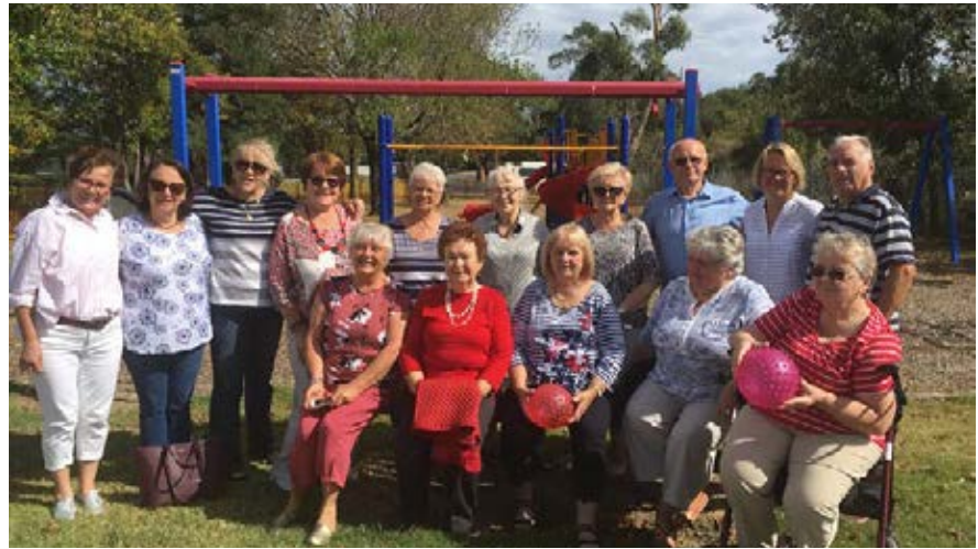
SSG SPORT Rowville during outdoor activity.