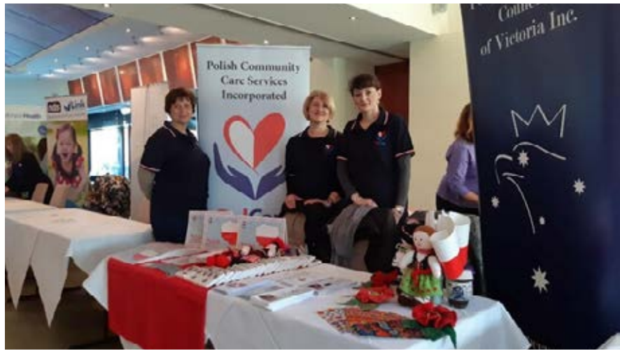
PCCS at Southern Metropolitan Region Alliance EXPO.