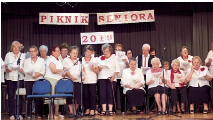
Seniors' Picnic in Rowville.