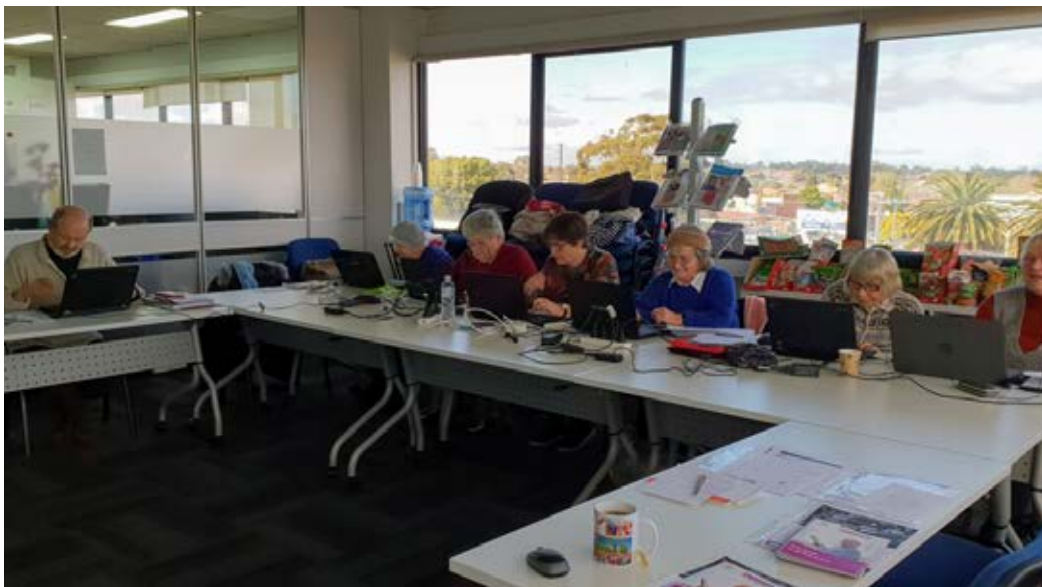
IT Group in Oakleigh during learning digital skills under the Be Connected program.