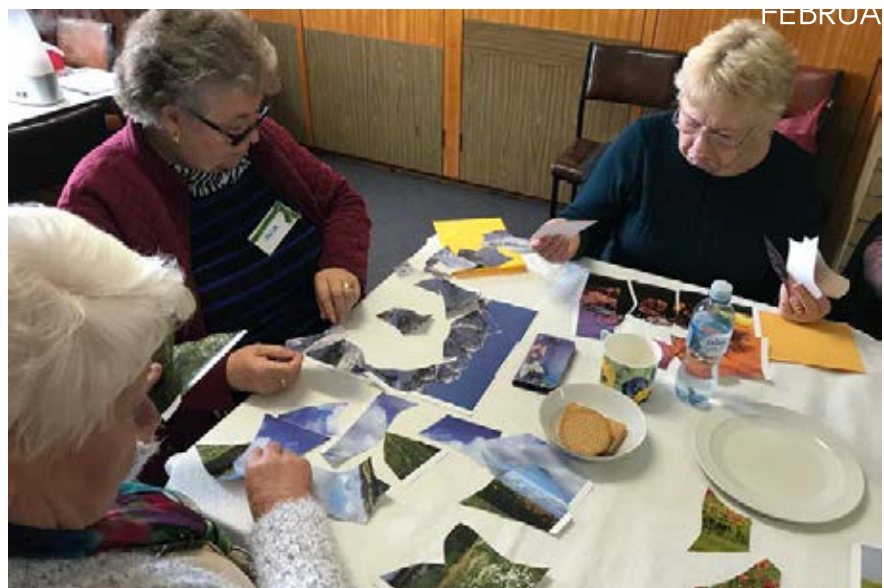
SSG Ardeer during puzzle activity.