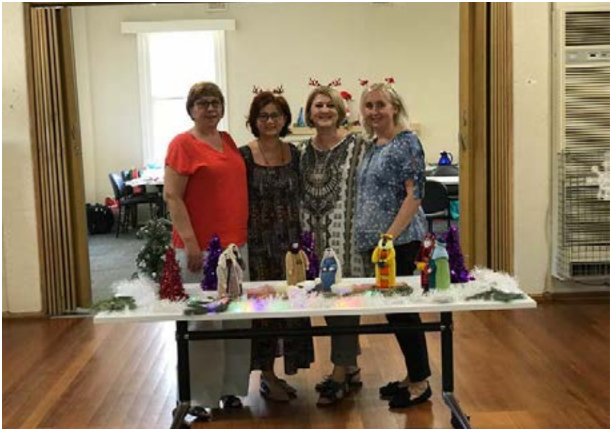
SSG Brunswick staff in a very merry mood.