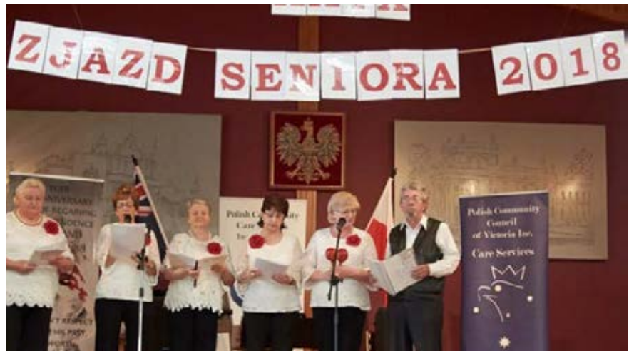
29th Seniors' Day in Polish Club in Albion.