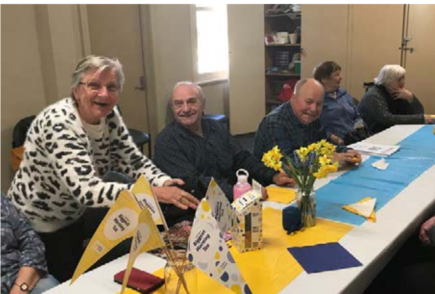
Supporting Cancer Council during Australian's Biggest Morning Tea.