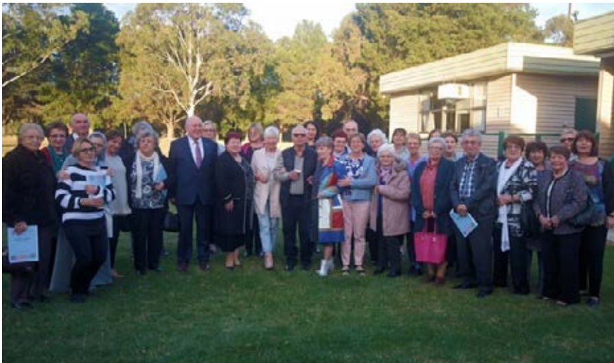
Volunteers of PCCV and PCCS.

Service System Development Program also helps community development and provides assistance to 20 Polish Seniors Clubs. The meetings are organized every two months for presidents of Polish Seniors Clubs, volunteers and carers. They have opportunities to undertake training, and exchange information and experiences. They also spend social time together.