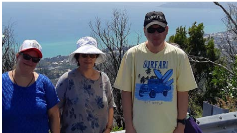
Excursion to Arthur's Seat.