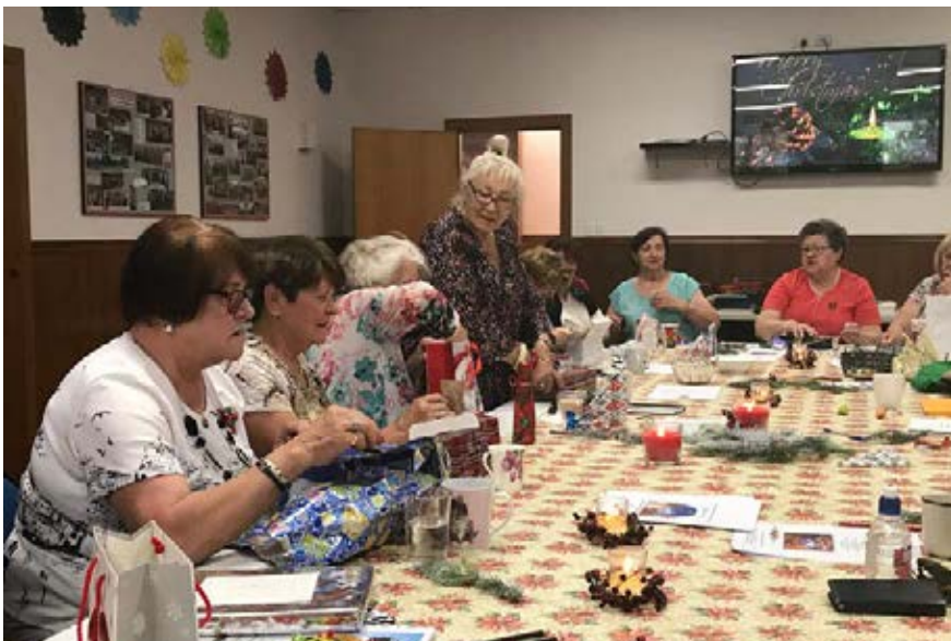
SSG RELAX Rowville during Christmas meeting.