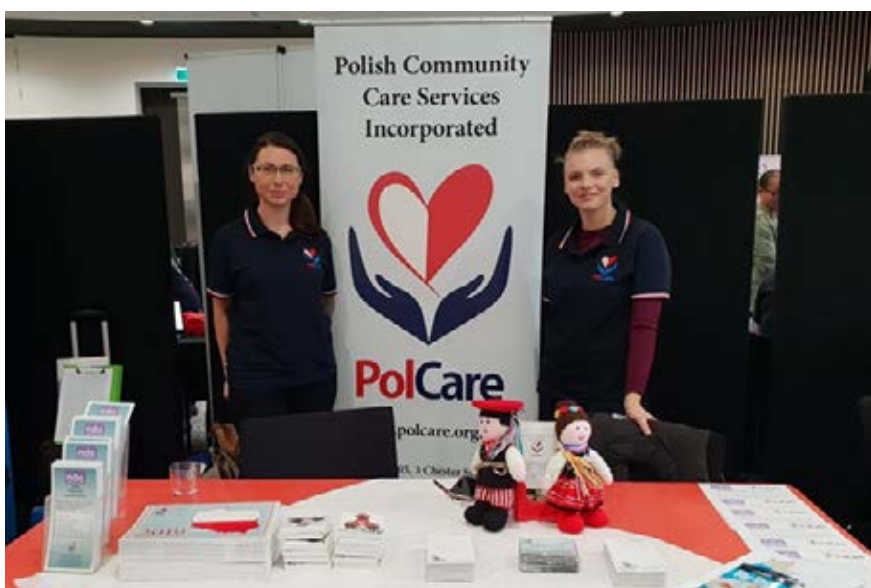
PCCS at Southern Region NDIS Service Provider EXPO.