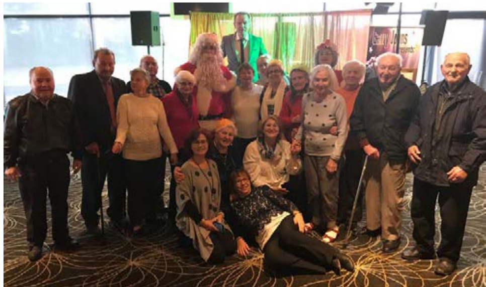
SSG Brunswick celebrating Christmas in July.