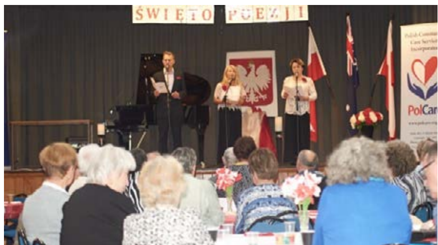
20th Seniors Poems Competition.