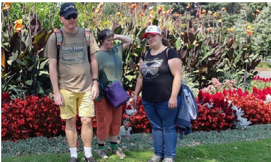
Excursion to Royal Botanic Garden.

During the year, we have been proud to support a growing number of participants, with the assistance of our Disability Support Workers, who have extensive experience in working within the community and disability setting. Furthermore, our Disability Support Workers have been able to provide exceptional care and support to enable participants to reach their goals, and be as independent as possible. All Disability Support Workers have the relevant qualifications and hold Certificate IV in Disability.