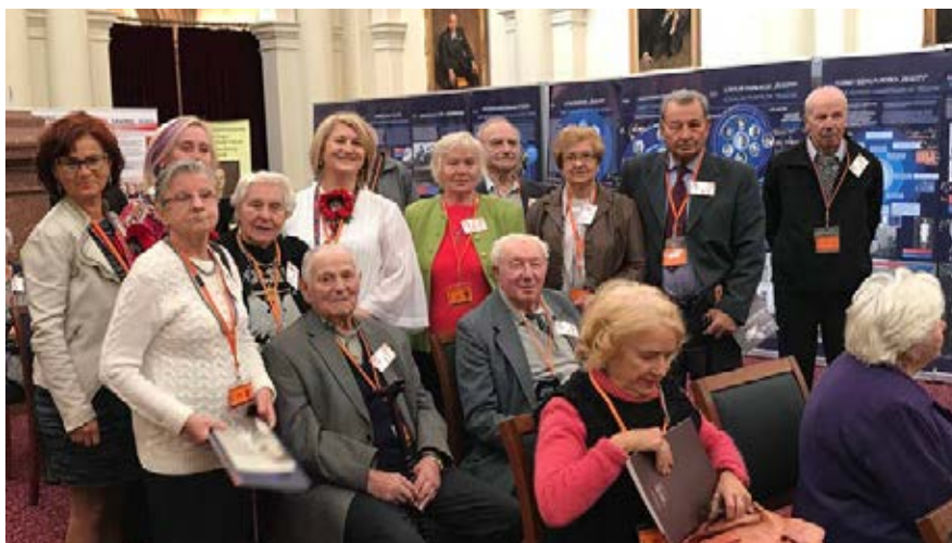
Volunteers, Presidents of Polish Seniors' Clubs and SSG Brunswick on the IPN's exhibition in the Victorian Parliament.