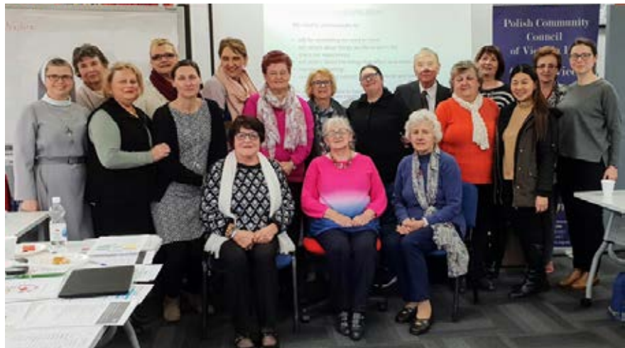
Training for volunteers provided by Swinburne University.