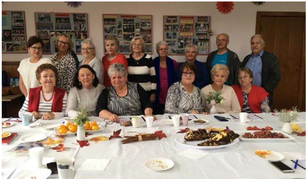
SSG SPORT Rowville

Throughout the year we have had up to 120 clients attend and participate in approximately 15,000 hours of activity time. Along with our group services, we offer transportation to and from SSG Rowville, Brunswick, Oakleigh and Doveton, via taxis and a company bus driven by our volunteers.