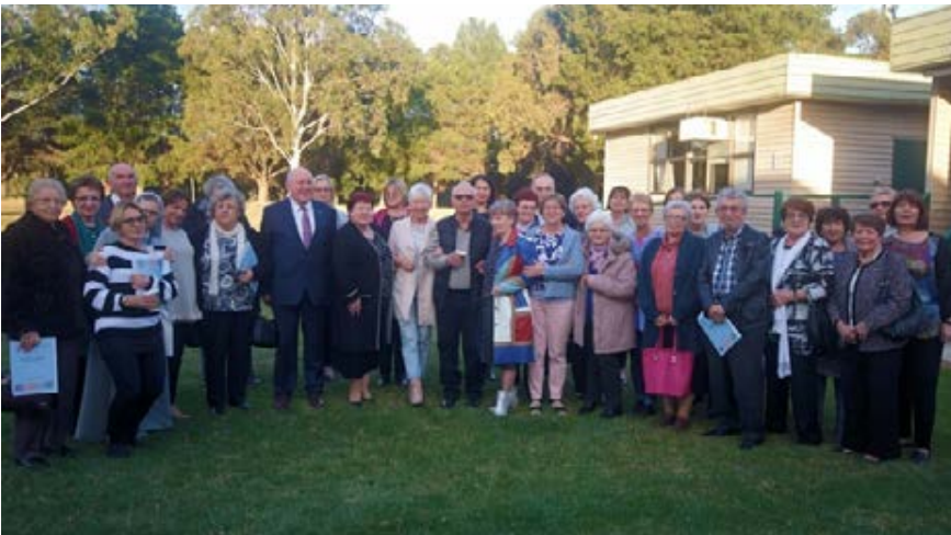
Celebration of the International Volunteers Day.