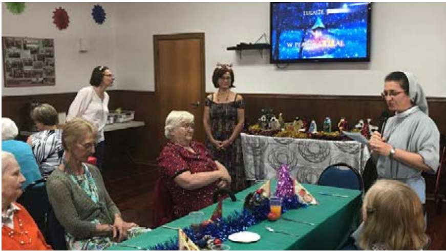
SSG Rowville during Christmas meeting.