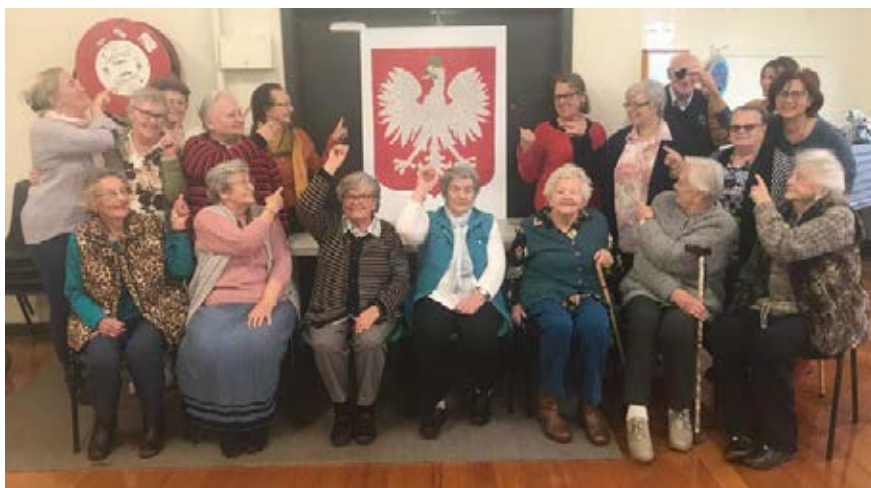
SSG Oakleigh with White Eagle - the Polish emblem which has been crafted by the SSGs Oakleigh, Rowville and Brunswick.