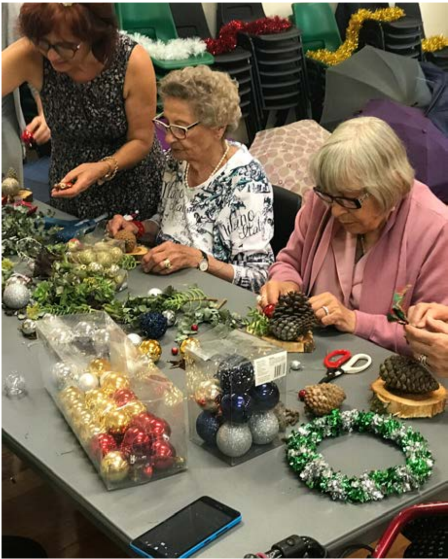
SSG Oakleigh during Christmas meeting.