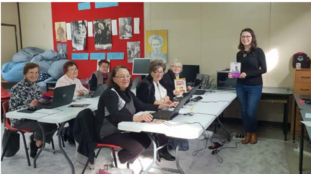
SSG RELAX Rowville during learning digital skills under the Be Connected program.