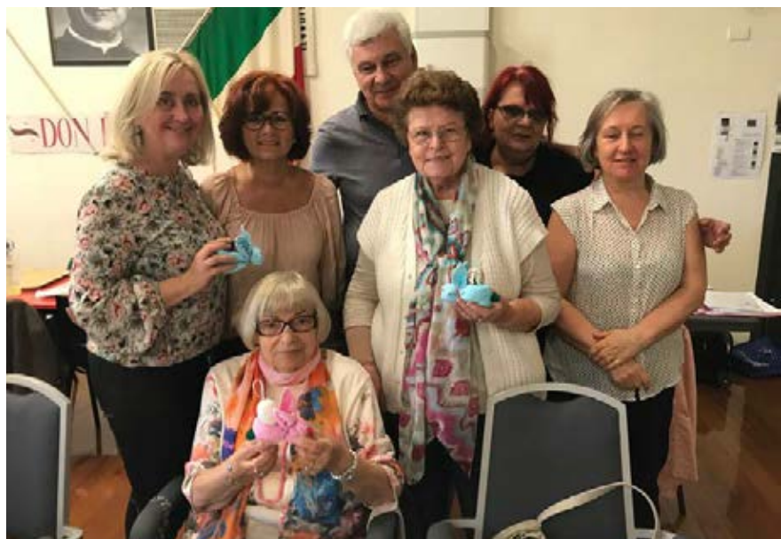
SSG Oakleigh during Easter meeting.