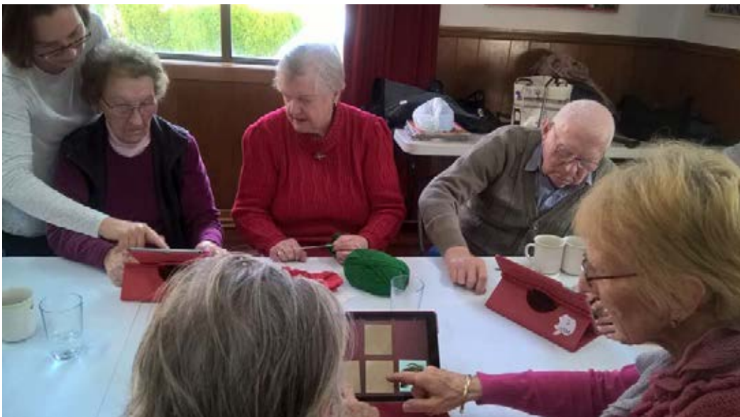
SSG Rowville during playing games on ipads.