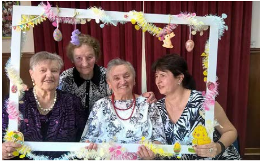
SSG Rowville during Easter meeting.