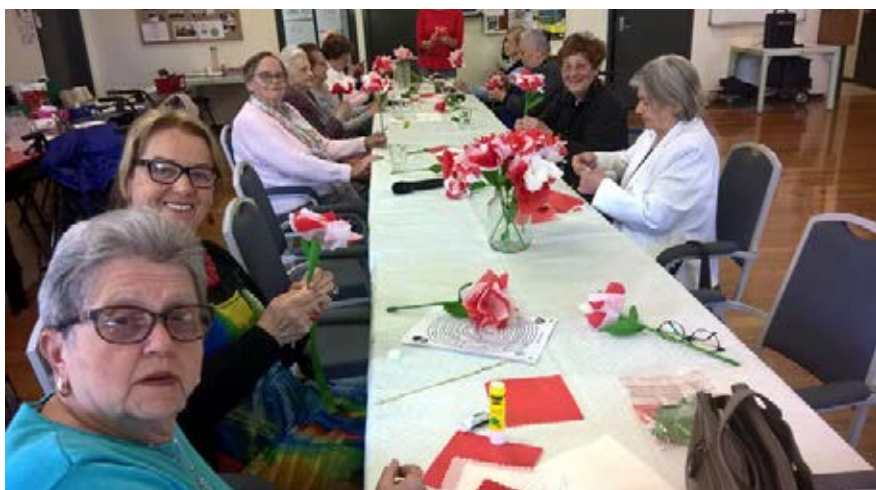
SSG Oakleigh during making tissue flowers in Polish national colours: white and red.