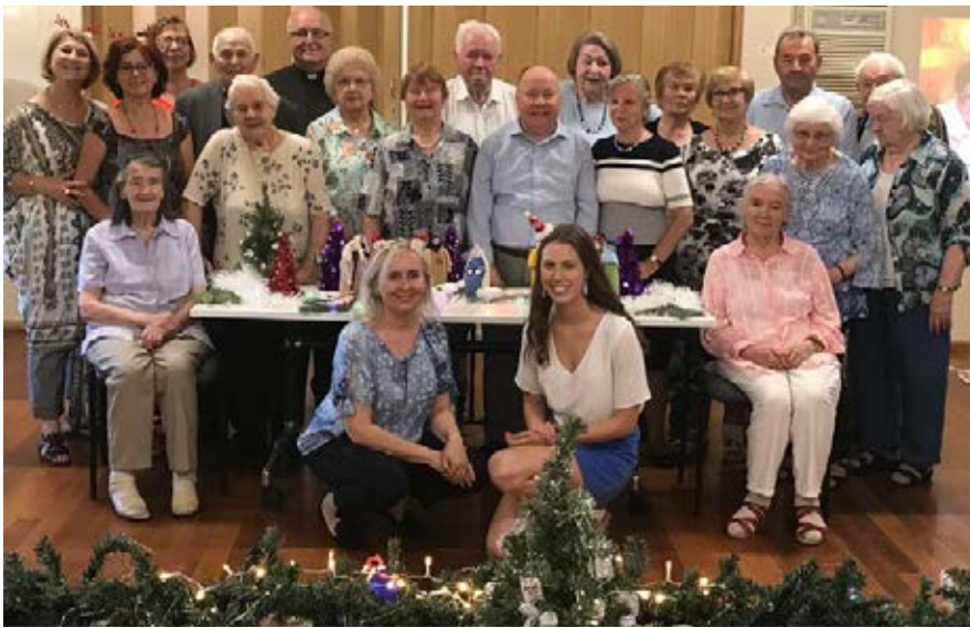
SSG Brunswick during Christmas meeting.