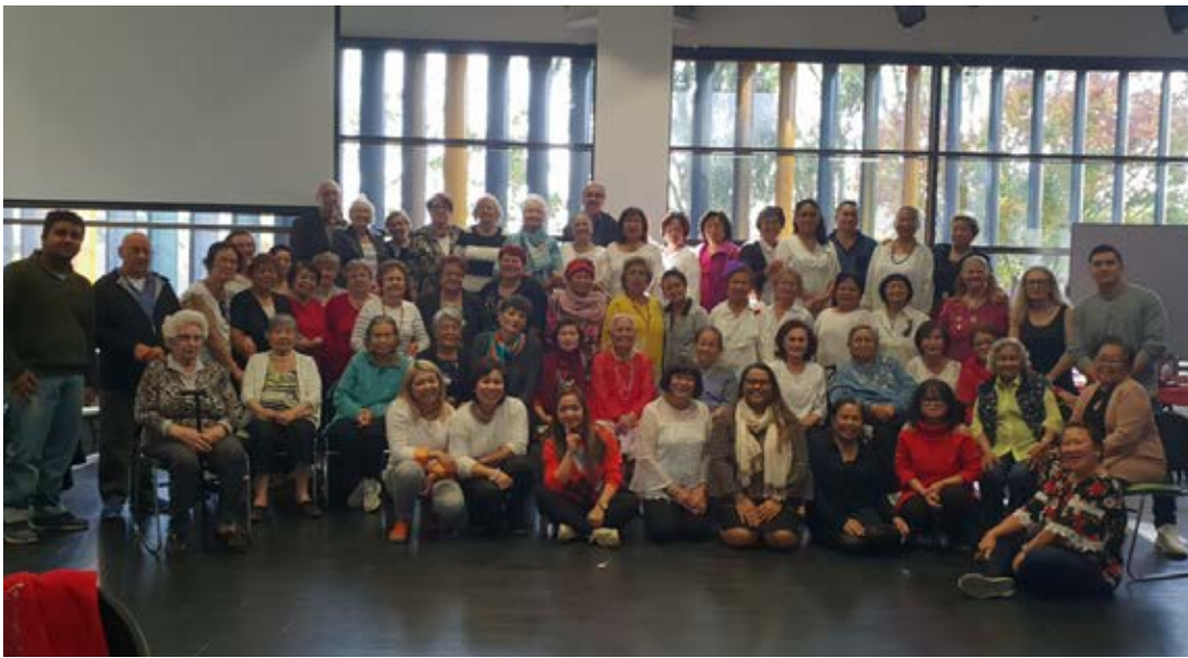
Meeting with Filipino Community - project "Love in any language".