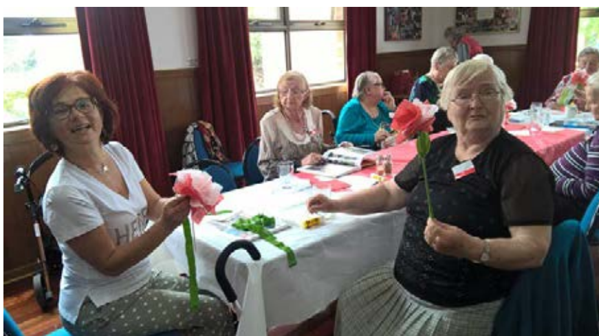
SSG Rowville during making a tissue flowers in Polish national colours: white and red.