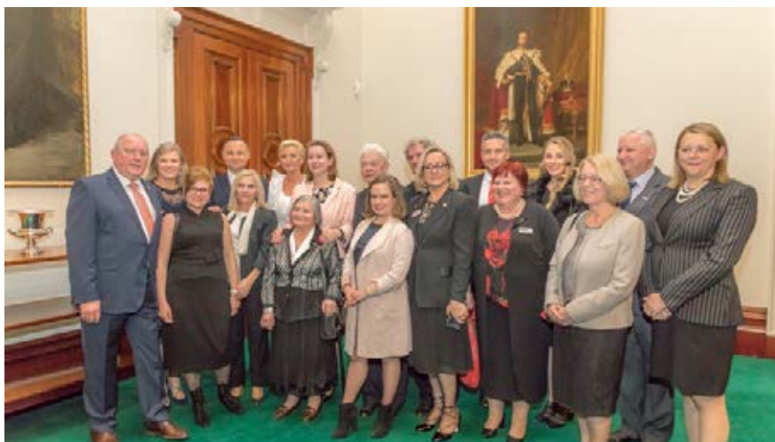
The Polish community during meeting with Mr. President and his wife at the Governor of Victoria during the first official visit of President of Republic of Poland in Australia.