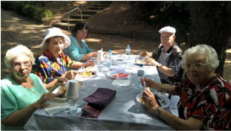
SSG Doveton during excursion to Wilson Botanic Park Berwick.