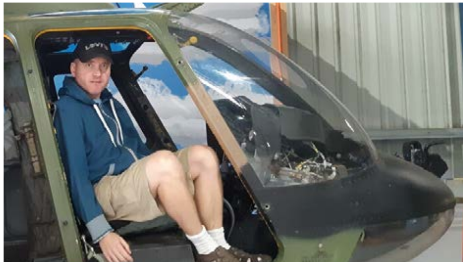
Excursion to Australian National Aviation Museum.