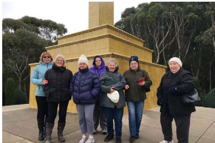
SSG Ardeer during excursion.