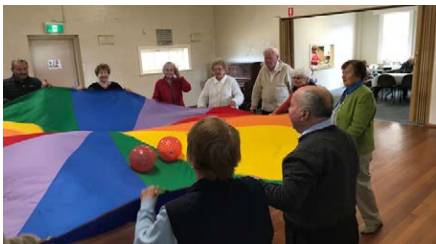
SSG Brunswick during playing with Klanza wrap.