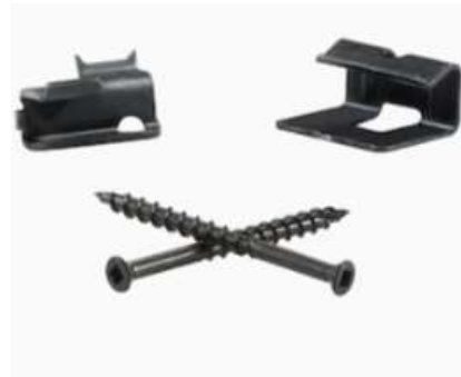
Figure 4: VersaClip