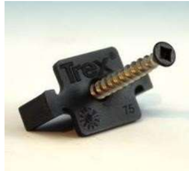
Figure 2: Trex