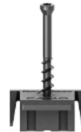
Figure 5: StealthLock™ Clip