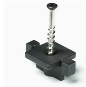
Figure 3: Stowaway