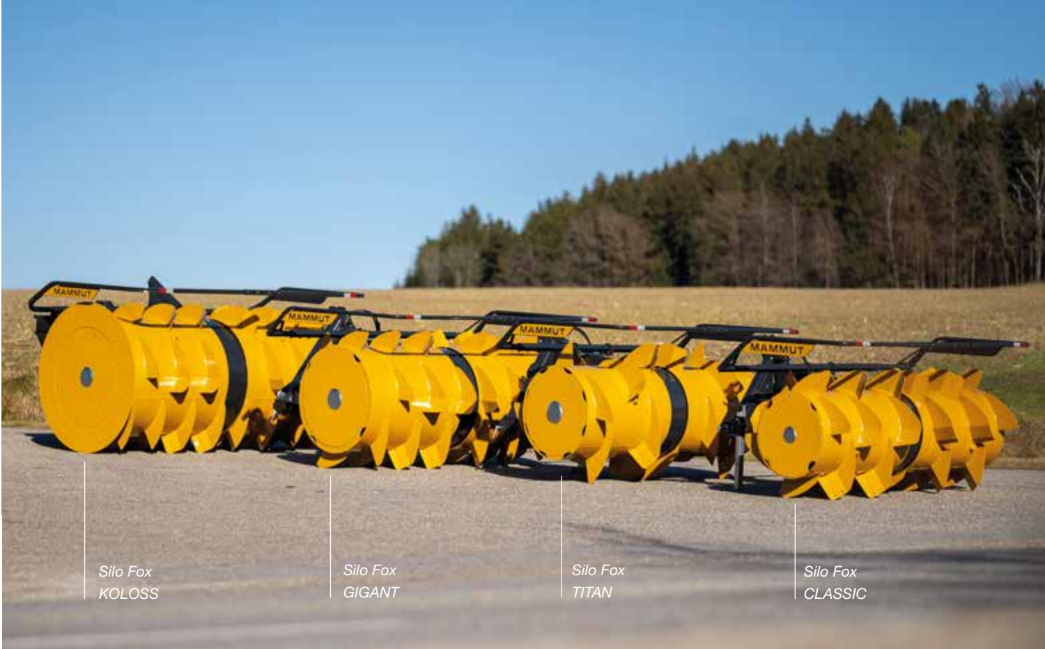
Silo Fox KOLOSS