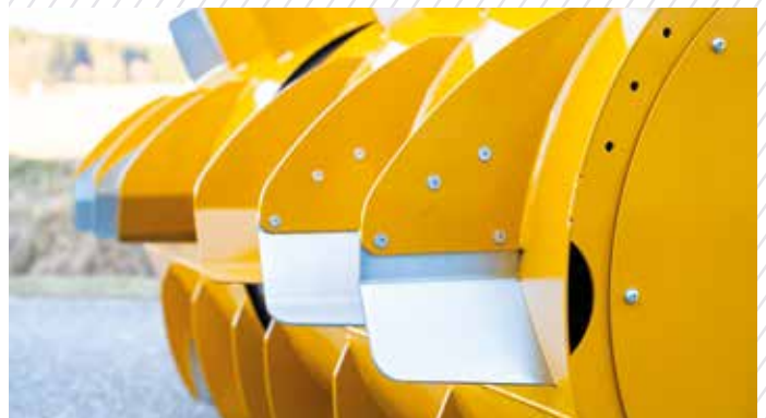
Individual spreading width adjustment for a perfect adaptation to the bunker silo.

From the type Silo Fox „SF 195 CLASSIC“ onwards, edged end pieces are also included as standard, which can be mounted on the straight outer throwing shovels facing either inwards or outwards. This allows the spread pattern to be individually adapted to each silo.