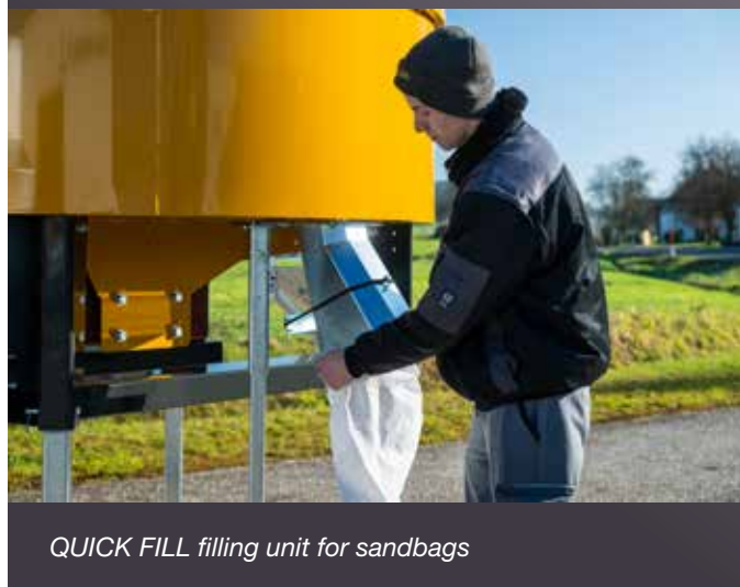
QUICK FILL filling unit for sandbags