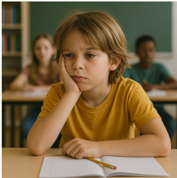
- Attention Deficit Disorder (ADD)