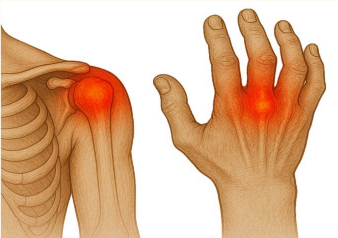
- Arthritis and joint degeneration