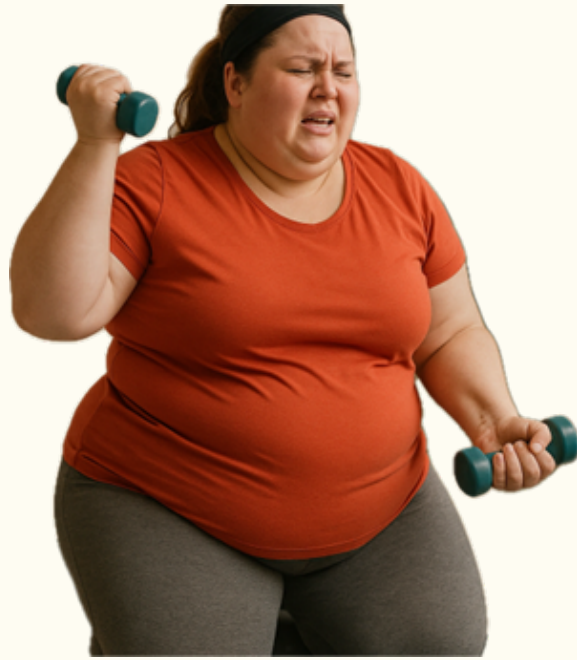
- Obesity with difficulty losing weight

tells us that your body is fighting something—and it signals the need for further evaluation.