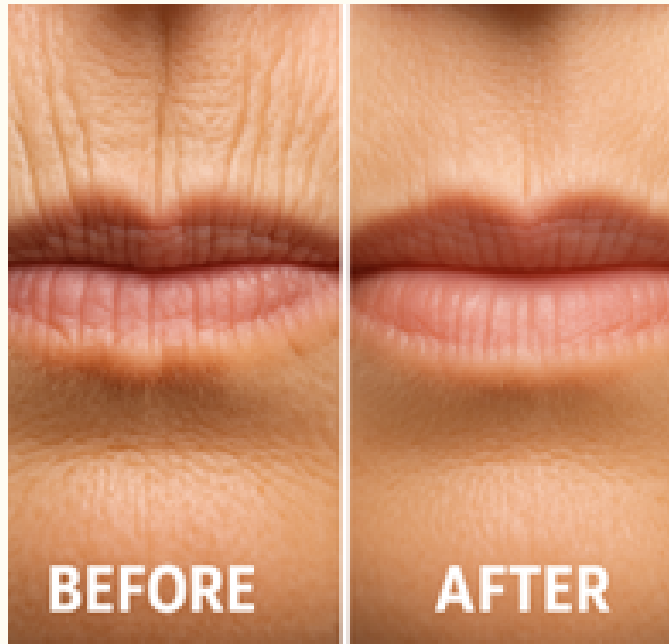
Before & after three months of daily BIO-KANA application.