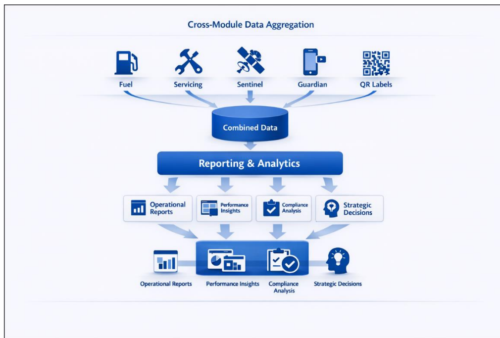
Illustrative concept showing how data from multiple M5 modules is combined to produce reporting and analytics insight.