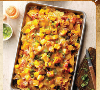
An unconventional take on nachos, using fresh fall ingredients.

Preheat oven to 400°F. Place pumpkin in a greased 15x10x1 inch baking pan. Drizzle with oil. Sprinkle with salt and pepper. Toss to coat. Roast until tender, 25-30 minutes, stirring occasionally. Reduce oven setting to 350°F. In baking pan, layer half each of the chips, beans, pumpkin, salsa and cheese. Repeat layers. Bake until cheese is melted, 8-10 minutes. Add toppings as desired. Serve nachos immediately.